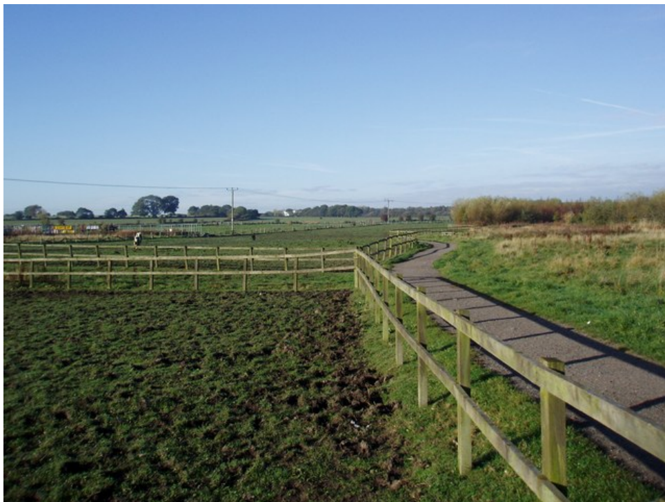
Above: Horse Paddocks

To access the western part of the site you will need to cross the busy A58 road from the car park. The footpath is immediately opposite. It's worth walking the 50 metres or so to join the main footpath and get away from the traffic noise before stopping to scan over the paddocks on your left hand side. These paddocks often contain Meadow Pipits, Skylarks and Pied Wagtails. Flocks of Goldfinches can sometimes be seen feeding on the dead seed heads, and birds such as Grey and Yellow Wagtails, Wheatear, Stonechat and Whinchat have been seen in and around the paddocks.