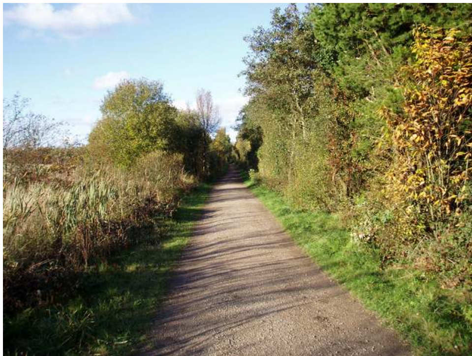
Above: Railway woodland/path

The path now turns left (North), and runs almost dead straight alongside the railway line. The stretch of woodland here often holds Great Spotted Woodpecker, Jay, Willow Tit and Siskin. At the end of this long straight section the path splits again. Turning right and under the railway bridge takes you onto the Abram Flashes area, turning left takes you back up a gentle slope with more open grassland on either side. Again Grasshopper Warblers are regular here and Stonechats have been seen around this area. Continuing on this path will eventually lead back to the car park.