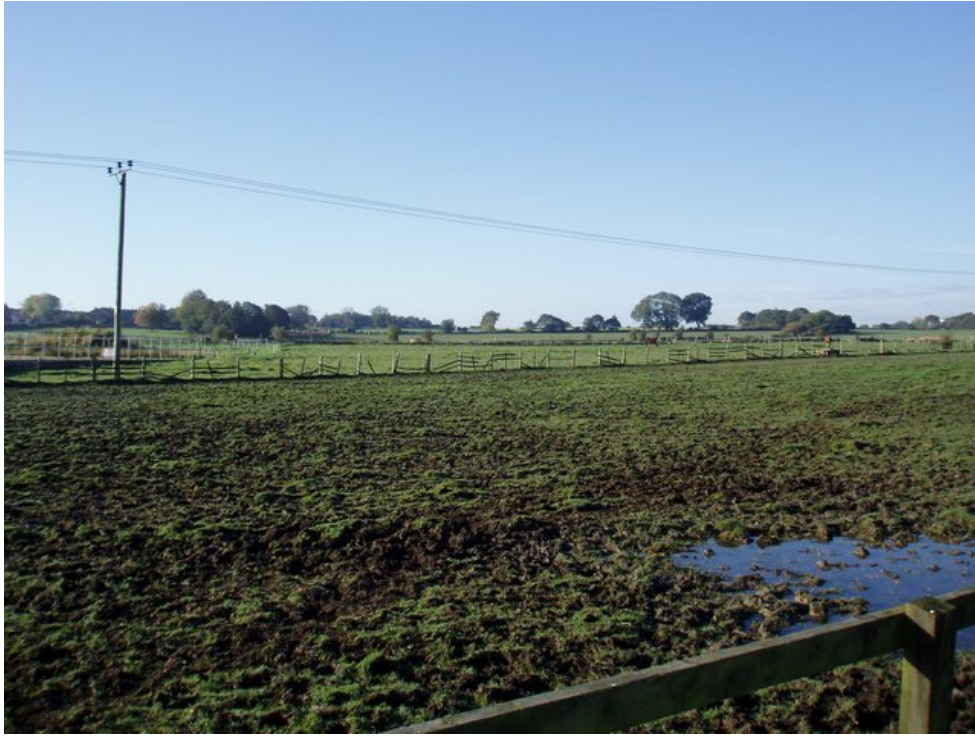
Above: Fields viewed from Viridor Wood itself