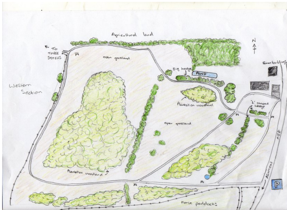
VIRIDOR WOOD WEST MAP

visit to Viridor can provide a pleasant couple of hours birding, throwing up the odd surprise, and a visit to the site could easily be combined with a visit to Three Sisters Recreation Area, Wigan or Abram Flashes or indeed Pennington Flash. None of which are more than 20 minutes away. Check out the Viridor sightings on the forum for a taste of what a few hours birding here could bring.