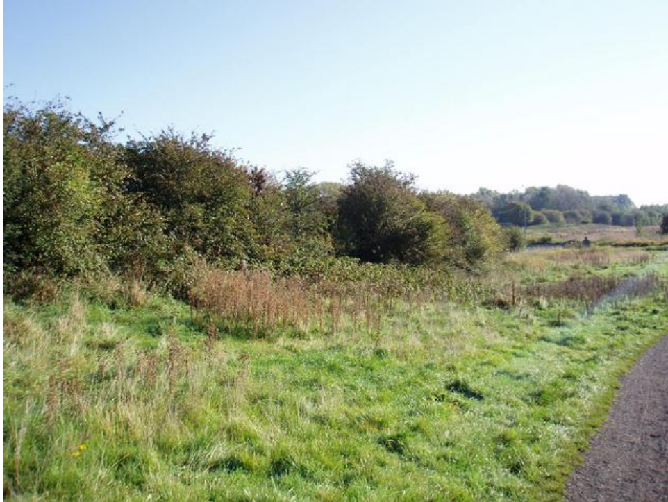
Above; 'L' shaped hedge near Mortons

When you arrive at the next path junction, it's worth scanning the open ground to your right as Short - eared Owl has been seen in this area. You then have three options, turn left to investigate the farm buildings of Mortons Dairy, which often have a Kestrel hanging around, turn right down the long straight path to re-join your route at an earlier point, or continue straight ahead to meet yet another section of hedgerow which again looks birdy. There is usually a flock of Goldfinches in this spot, along with Whitethroats in summer and the inevitable Blackbird, Song Thrush, Robin and Dunnock, but it looks like it should hold much more. The path then turns right, back towards the entrance.