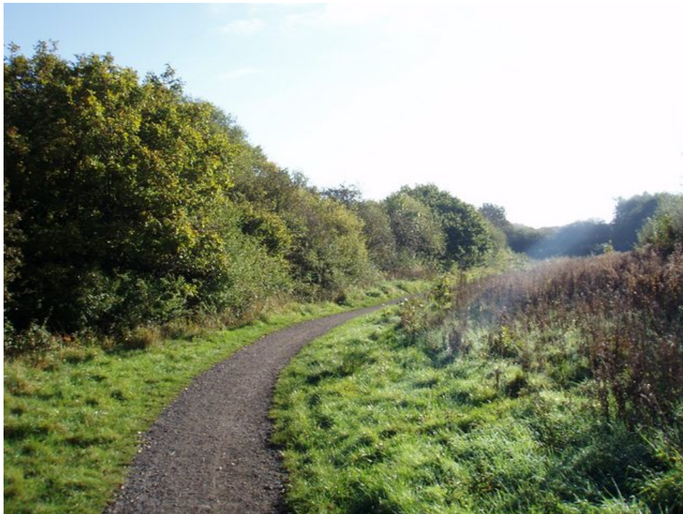
Above: The 'Big Hedge'

The path eventually crosses a small stream beneath some mature Oaks, and bears left onto a favourite bit of the site. Another mature mixed hedgerow (Big Hedge as the few regulars have christened it) on the left of the path extends for the next couple of hundred metres or so and is bordered by a pond at one point. This hedge feels 'birdy' and birds often flit between the hedge, the plantation woodland and the grassland on the other side of the path. A Sedge Warbler on passage was skulking here once, and Blackcaps love the scrubby wet woodland at the end of the pond. The hedge contains a few conifers and Goldcrests can often be heard if not seen in these.