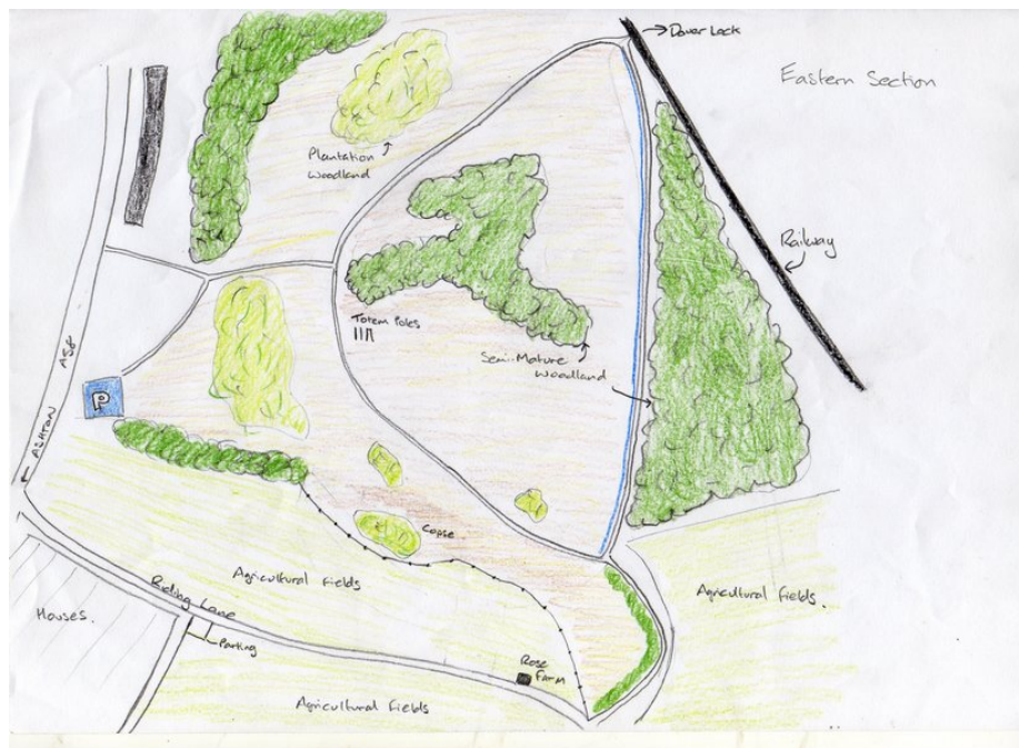
VIRIDOR WOOD EAST MAP