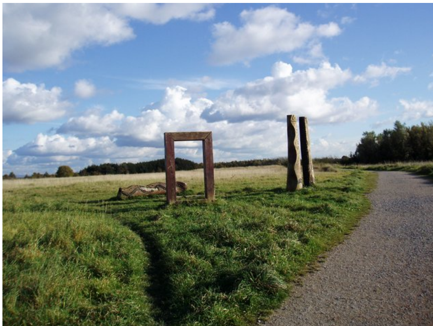
Above: Totem area

Again the woodland on the right contains all the usual suspects, and it is possible to walk into this area, flushing the odd Woodcock or Snipe in the winter months, but the main interest starts a bit further along. At the top of the path turn right towards the 'Totem Poles'. The open grassland always has plenty of Skylarks present, Barn Owls have been reported here on several occasions and Short-eared Owl, Long-eared Owl and a calling Quail have also been recorded. Grasshopper Warblers often reel from these areas in spring, while Willow Warblers and Chiffchaffs sing from the plantation and the more mature woodland. Tawny Owl has been seen around the mature woodland block and there are often species such as Greenfinch, Chaffinch and Bullfinch flitting around.