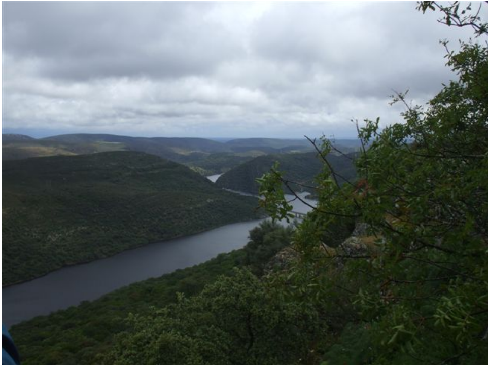
Above: View from Castillo de Monfrague