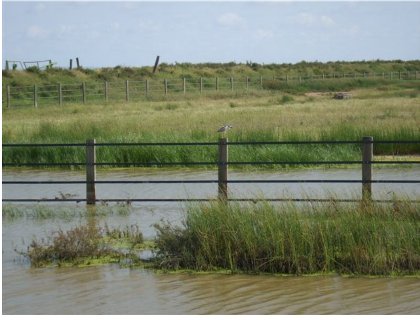
Above: Donana scene