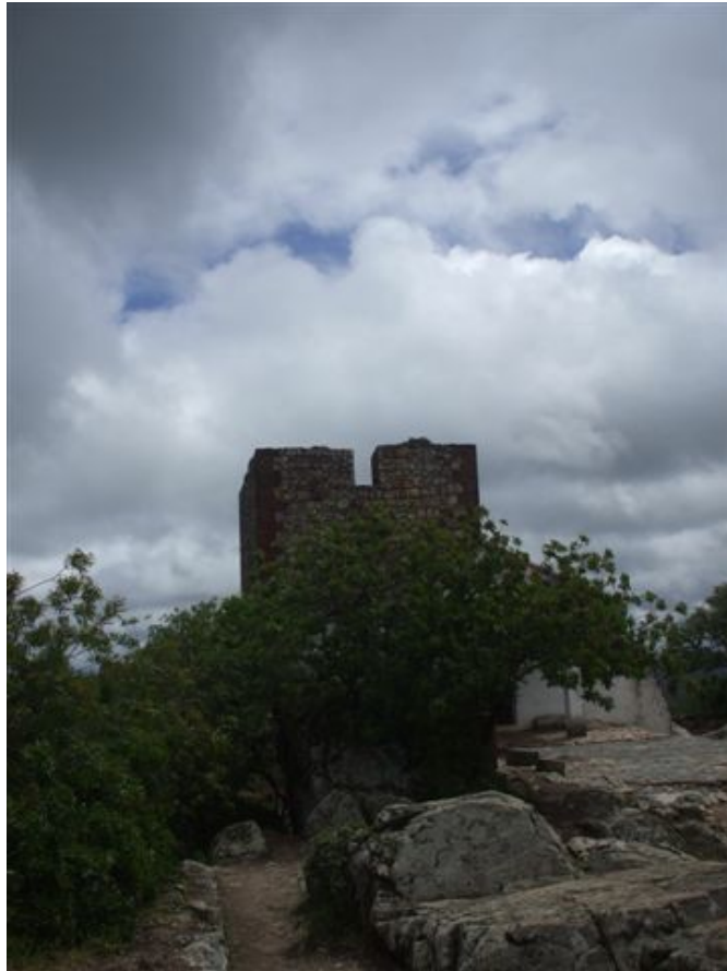
Above: Castillo de Monfrague