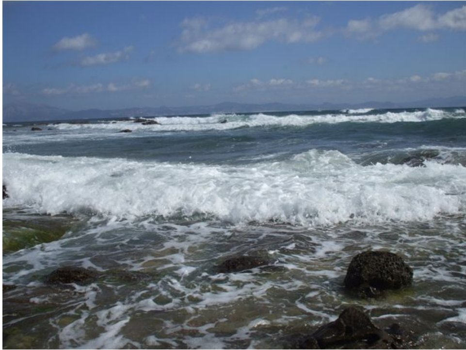
Above: Adjacent to Tarifa harbour