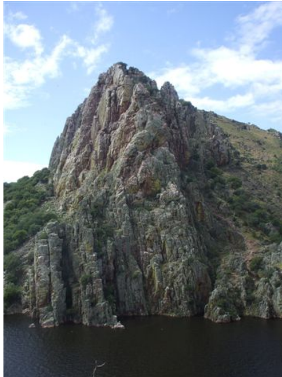
Above: Pena Falcon, Monfrague