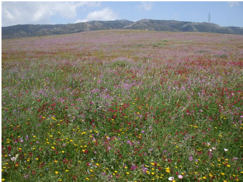
Above: Meadow, Valle del Santuario