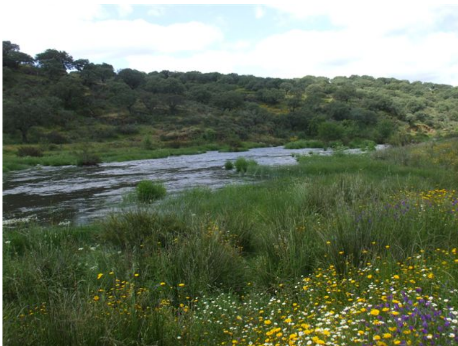
Above: Rio Almonte, Extremadura