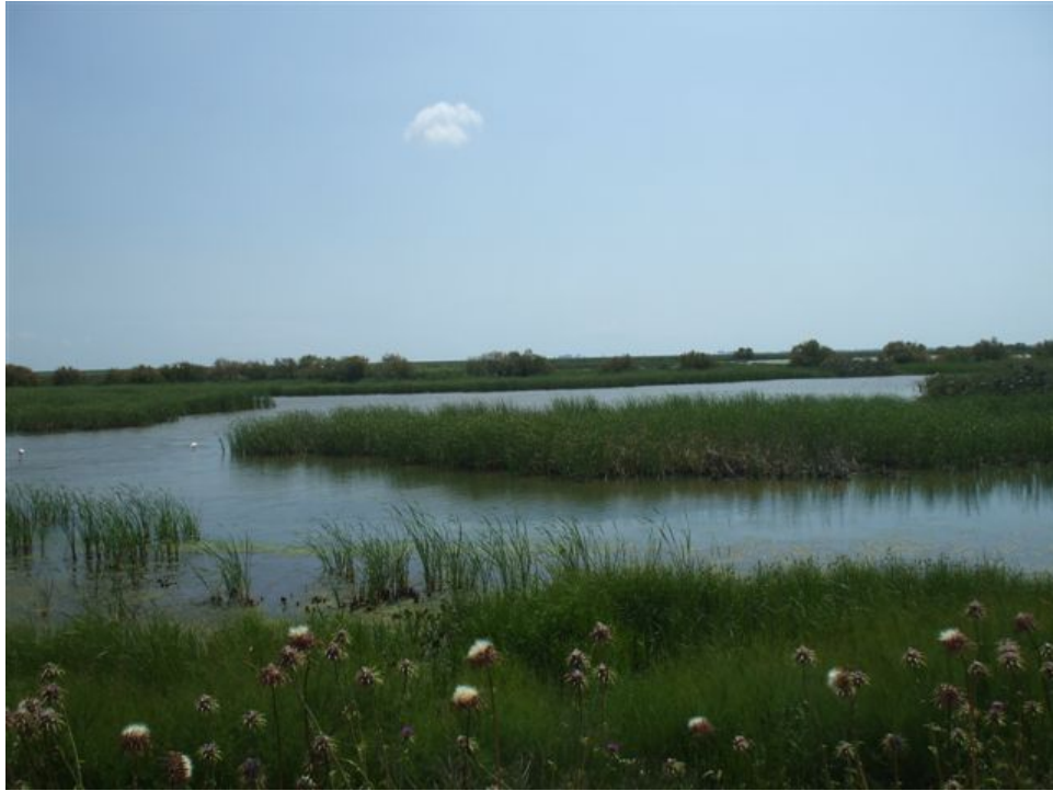
Jose Valverde Centre, Coto Donana