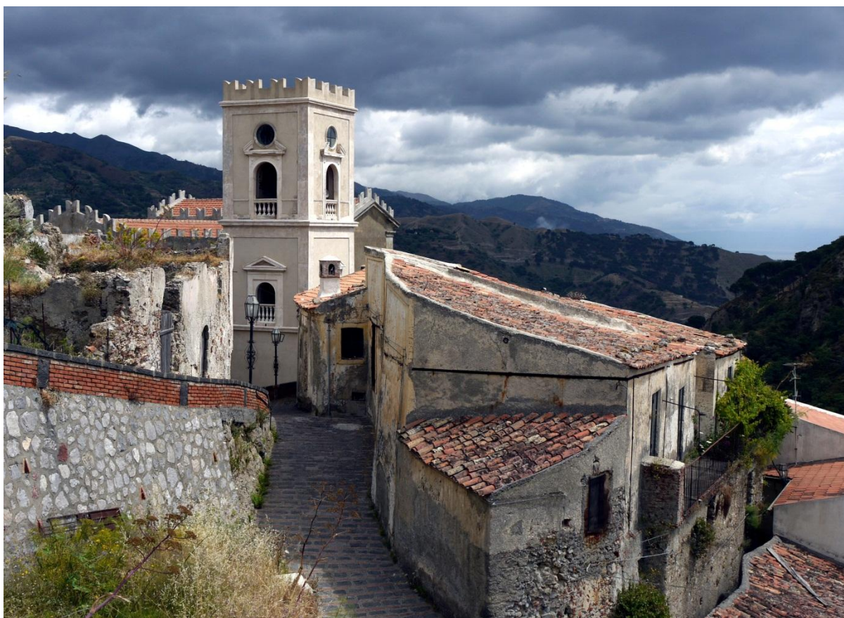
Savoca, the hill village north of Taormina where parts of “The Godfather” were filmed