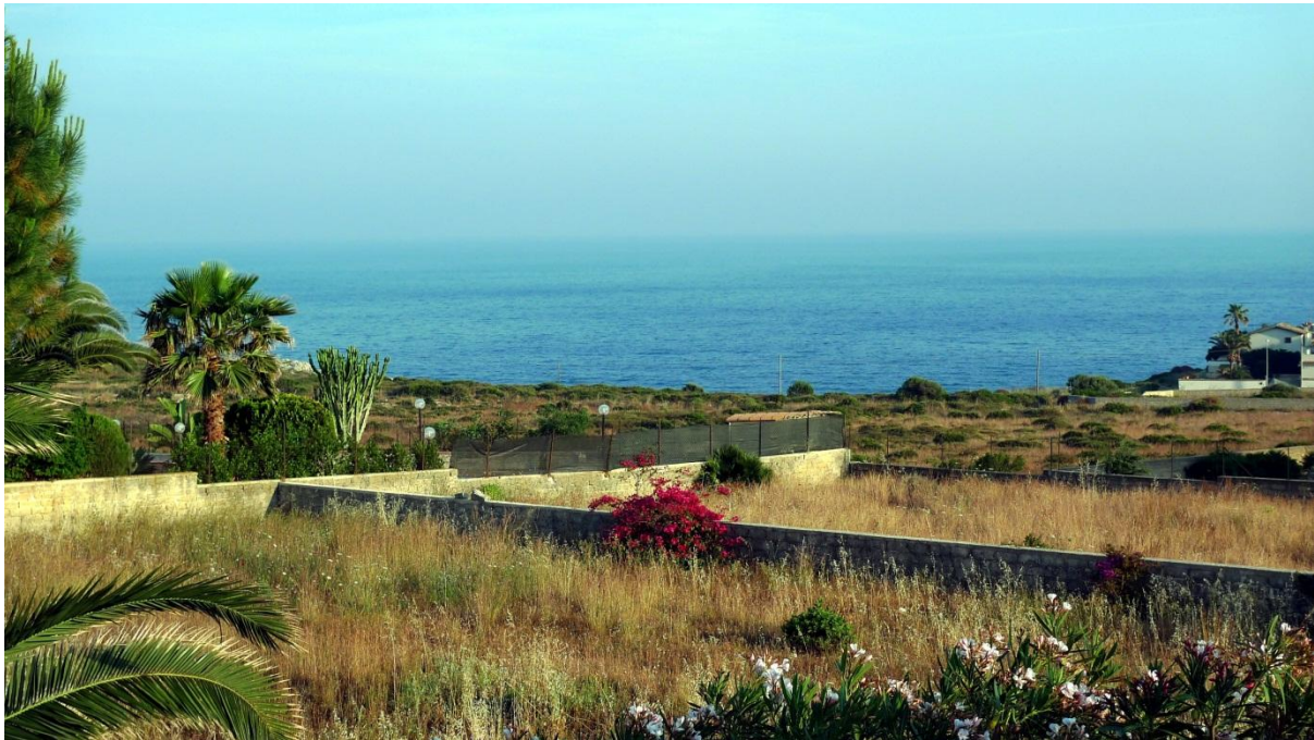
View from the roof terrace of Villa Casablanca, Plemmirio

For our second week we rented a villa at Plemmirio, south of Syracuse. Plemmirio is an unspoilt, protected area with a rocky coastline, clear seas, coral reefs and large stretches of coastal garigue. We found the Villa Casablanca on the Owners Direct web-site and really loved the place. It is characterful, with large grounds which look over garigue to the sea. From a birding point of view, it has a large roof terrace which is excellent for sea-watching and is also just a fifteen minute walk from what is probably Italy's prime migration and rarity site, at Capo Murro di Porco. http://www.ownersdirect.co.uk/italy/IT132.htm