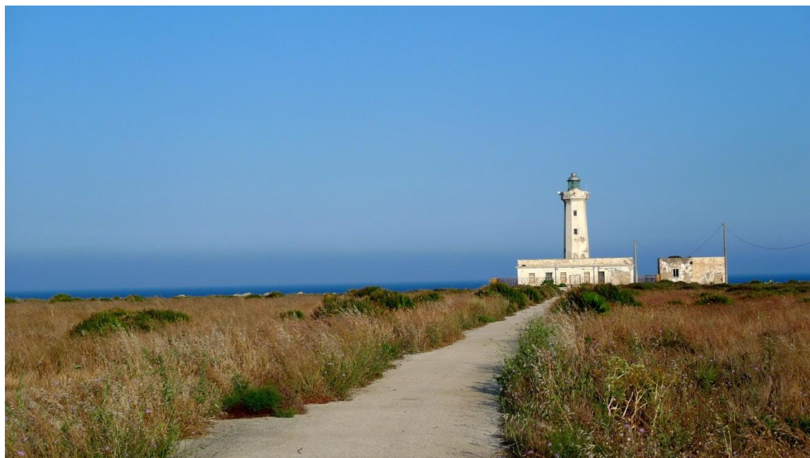
The path down to the lighthouse at Capo Murro di Porco

Scops Owls would provide the soundtrack to a very special place. The villa garden, which includes a large, weedy plot outside of the shady gardens also turned up some good birds, with Woodchat Shrike, Spotted Flycatcher, Crested Lark, Serin, Spanish Sparrow and Sardinian Warbler all regulars.