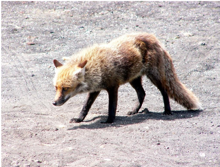
A fox scavenging on the slopes of Mount Etna

At the northern approach to Mount Etna at Piano Provenzana, you can park and walk up through lava fields, with pine woods all around. This was productive for birds like Rock Bunting, Wood Lark, Cuckoo, Northern Wheatear, Chiffchaff, Serin, Nuthatch and Coal Tit, alongside more common species.