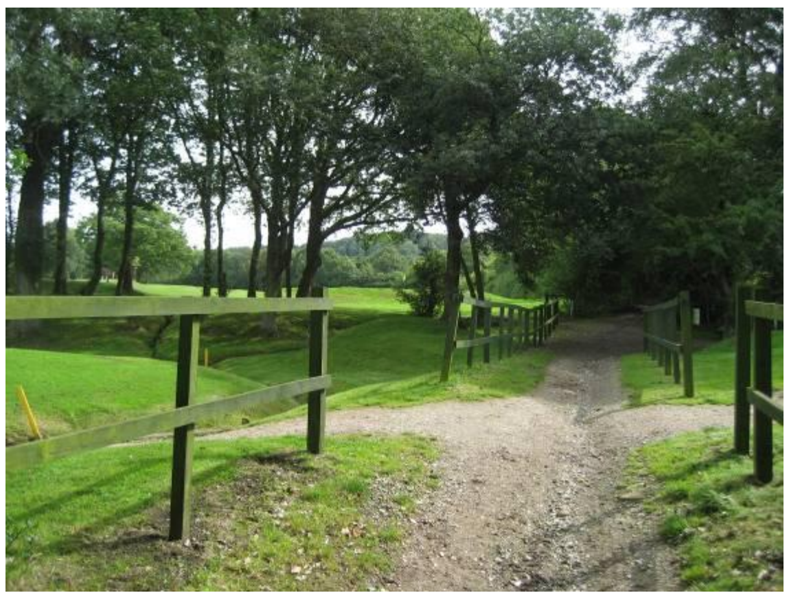
Footpath across Mellor Golf Course (turn left at the wooden stile)