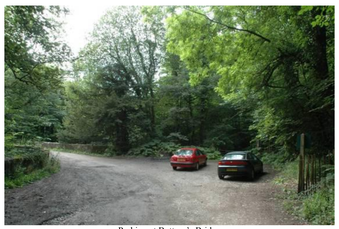
Parking at Bottom's Bridge

A circular route of about three miles is described passing North and Main Lakes, Windybottom Farm, Mellor Golf Course, Linnet Clough and (as a detour) Linnet Clough Reservoir. But the area is interlaced with many footpaths and alternative walks could easily be devised. As would be expected an early morning visit pays dividends. Later in the day, and especially at weekends, you may be sharing with dog walkers, joggers, hikers, mountain bike and trail bike riders but you will have to get up early to beat the fishermen.