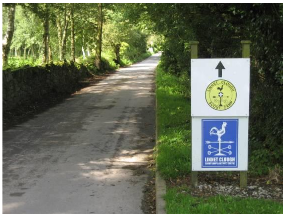
Road passing Linnet Clough camp site