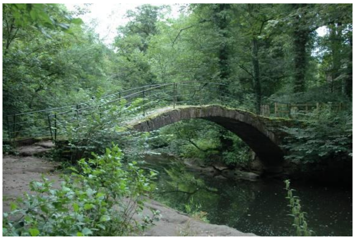
'Roman Bridge' at Strawberry Hill

Do not cross the bridge but continue along the farm track until the railway tunnel is reached. The horse paddocks either side of the track is a good spot for Green