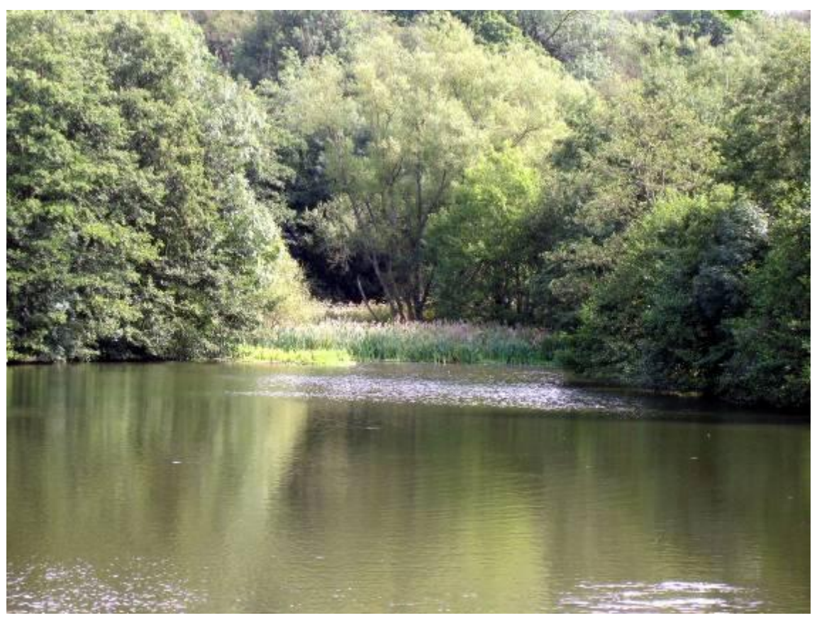
Linnet Clough Reservoir

Return to the bridleway and continue downhill passing Prescott Old Hall Farm and Bottom's Hall, where many pairs of Swallows breed, and continue straight on along Lakes Road to complete the circuit.