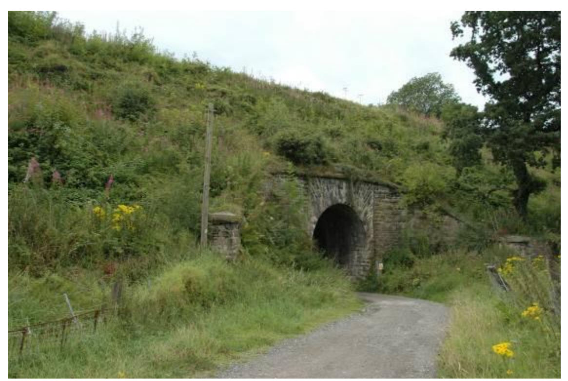
Tunnel at Windybottom Farm

Woodpecker and winter thrushes. Pass through the tunnel, looking out for warblers in summer and pass Windybottom Farm.