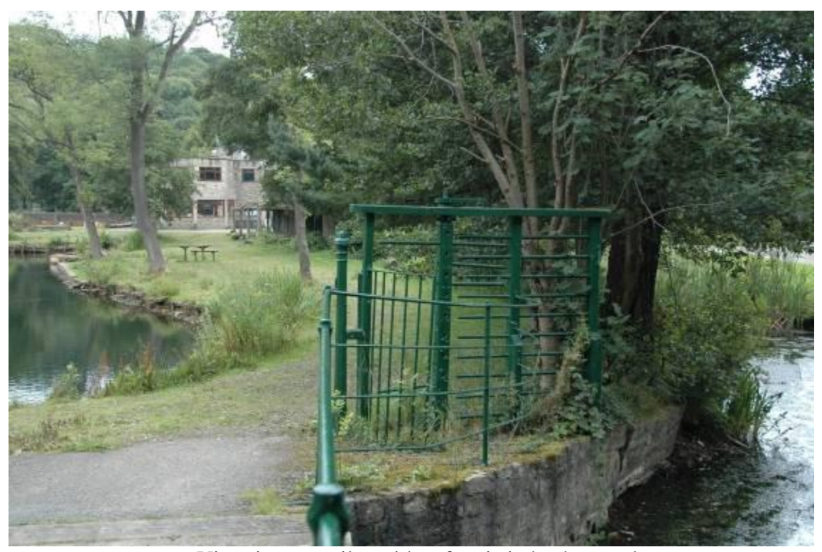
Victorian turnstiles with cafeteria in background

The River Goyt rejoins the road here where Kingfisher, Dipper and Goosander are often seen. Conifers hold breeding Goldcrest and Coal Tits.