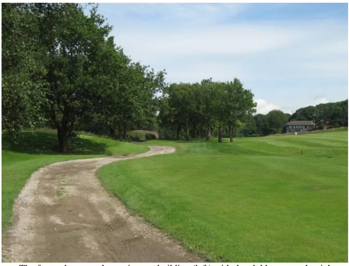
The footpath passes the equipment building (left) with the clubhouse on the right