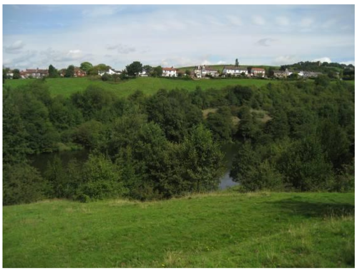
Linnet Clough Reservoir and panorama

If time allows a detour could be made to Linnet Clough Reservoir. Before the raised stone path by the side of the bridleway (see photograph above) look out for a footpath sign on the right hand side which leads across pasture with scattered Hawthorns. One day a shrike may be found here but this scrub and the trees around the reservoir hold many breeding warblers. Look out for Blackcaps, Chiffchaffs, Willow Warblers, Garden Warblers, Whitethoats and Lesser Whitethroats. The water itself, although secluded, is often less productive but from this spot there is a good overview of the surrounding hills. Raptors often seen from here include Sparrowhawk, Kestrel and Buzzard.