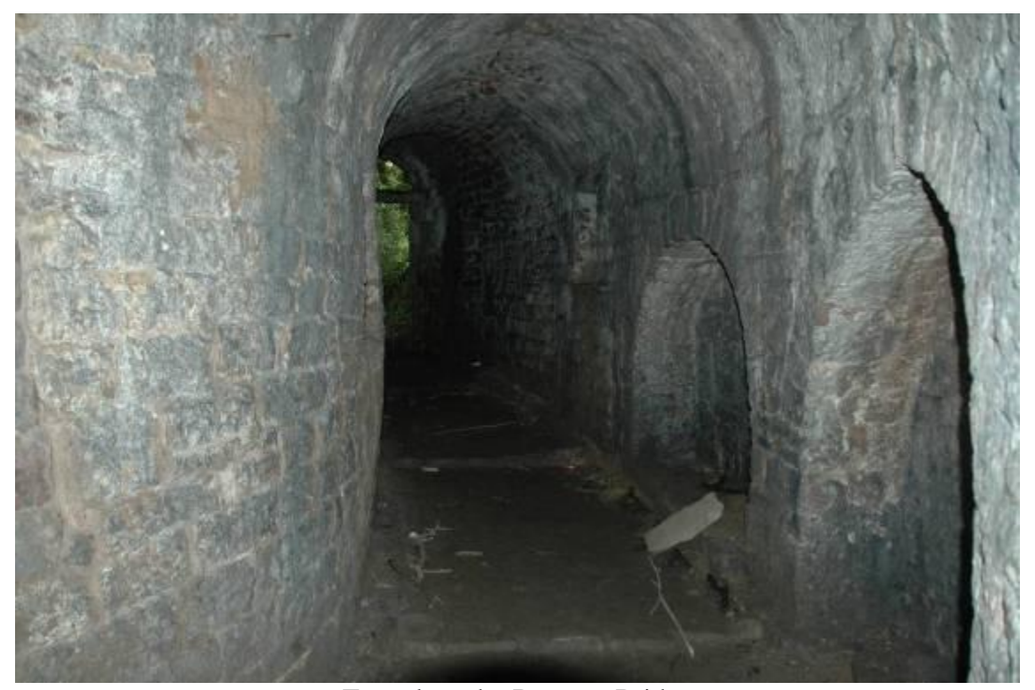
Tunnels under Bottoms Bridge

Dippers and Cormorants are quite often found on the river and the expected suite of common birds nest in the surrounding woods. The occasional Woodcock may be flushed in winter and Roe Deer may startle the visitor when bursting from cover.