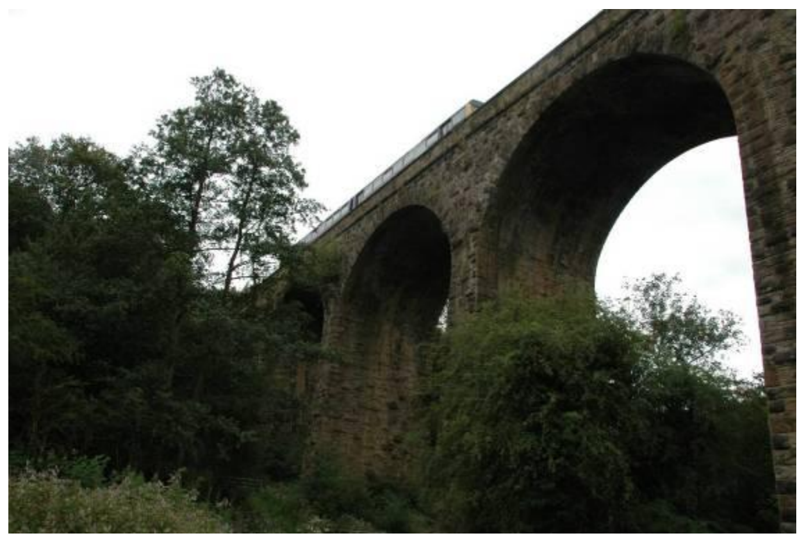
Viaduct over the Goyt

indicator of the cleanliness of the water. Continue for 300 metres through riverside woodland ignoring the first footpath sign on the left and pause at the pretty packhorse bridge at Strawberry Hill.