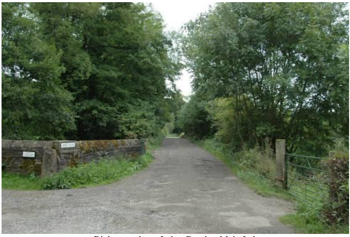
Right turn down Lakes Road to Main Lake

At the end of North Lake turn right passing Bottom's Hall to reach Main Lake. There are often Grey Wagtails in the stream nearby and the horse field on the right has hosted Merlin in the past.