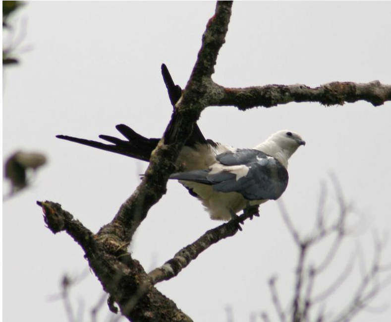
Above: Swallow-tailed Kite