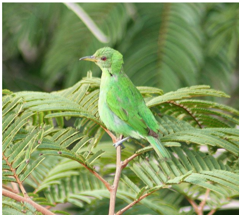
Above: Green Shrike-vireo