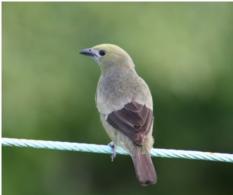
Above: Palm Tanager

After arriving around midnight to a little light rain and distant dramatic lightning, the stage was set for our first dawn and the much anticipated view over the rainforest from the Canopy Tower . However, dawn was reluctant to break due to heavy rain and low cloud, and any birdsong had to compete with the accompanying thunder. The first bird then was viewed from indoors with the accolade going to the drabish Palm Tanager. More inspiring fare was soon at hand with Collared Aracari and Keel-billed Toucan both visiting fruiting trees just outside the windows.