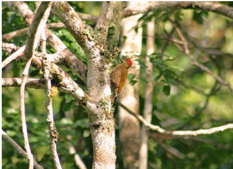
Above: Stripe-cheeked Woodpecker