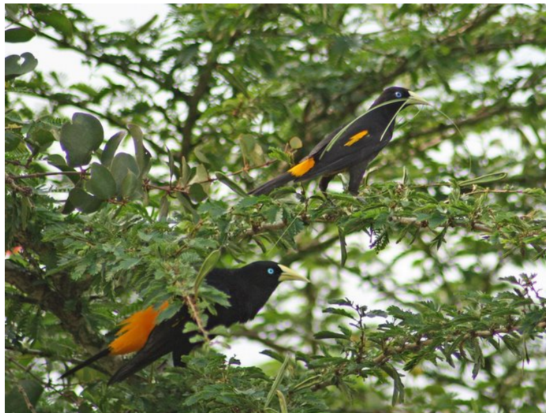
Above: Yellow-rumped Caciques