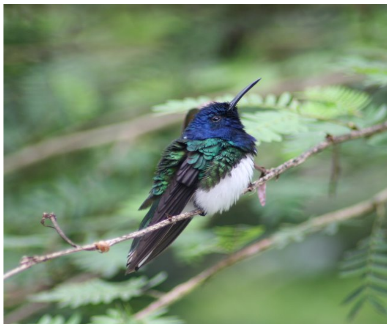
Above: White-necked Jacobin

So it was off to the famous Pipeline Road for a day which began at 6.00 a.m. and ended just before 5.00 p.m. It was hot, sweaty, and hard work but reaped many rewards in the shape of some hard to see birds. The first new birds though were not seen too well, like the red-throated ant tanager, or were a little uninspiring, as per rufous mourner. It took the appearance of a superb perched raptor like the Slaty-backed Forest Falcon to give things a boost. This was to be the first in a trio of such sightings. Distant tapping was soon pinpointed and found to be the work of a gang of four Lineated Woodpeckers who were certainly doing some damage with their massive bills. Squirrel Cuckoos stepped up to the mark after inadequate views yesterday: bold birds in bright rustiness. But something much, much smaller was our next delight. Alexis played the song of the Black-capped Pygmy Tyrant apparently without luck, but after we had moved a little way off and then returned, we found that a pair of the birds had appeared from nowhere. More than this, we had been standing close to what turned out to be their nest which was right next to the road. After they had decided that we were no threat, one of the birds flew into the flimsy hanging cup and proceeded to sit in the grassy hammock, staring out at us looking cute yet vulnerable. Some more birds with long or tongue twisting names followed this, with good views had of Ruddy-tailed Flycatcher, Olivaceous Flatbill, and Checker-throated Antwren.