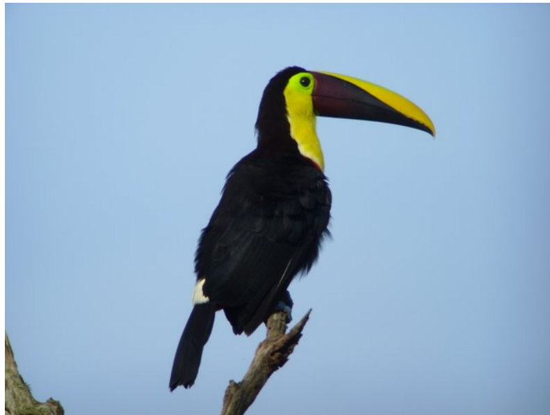
Above: Chestnut-mandibled Toucan

The observation deck was pretty quiet with only a female Summer Tanager that was new. Our first port of call was the Summit Gardens , which appeared a bit tame after some of the places we had visited but the well-scattered trees allowed us to see the birds that were there very well. Our first perched Orange-chinned Parakeets came into that category, as did the Thick-billed Euphonia. Fly over Short-tailed Hawk and Swallow-tailed Swift were harder to appreciate, but an impressive Grey Hawk compensated by sitting low in a nearby tree. And to prove that lightning can strike twice, we had another daytime flying Nighthawk, this time a common, which also proceeded to roost on an exposed branch. Mention should also be made of the two Tent-making Bats in their tree roost that we were able to marvel at just a few feet overhead.