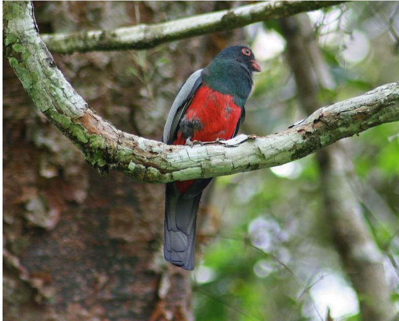
Above: Slaty-tailed Trogon

We had only been at this place for about six hours, but such a carnival of colour and sound had been planted in our minds that they would surely play across our memories for the rest of our lives. Hopefully it will continue to play on in real life too.