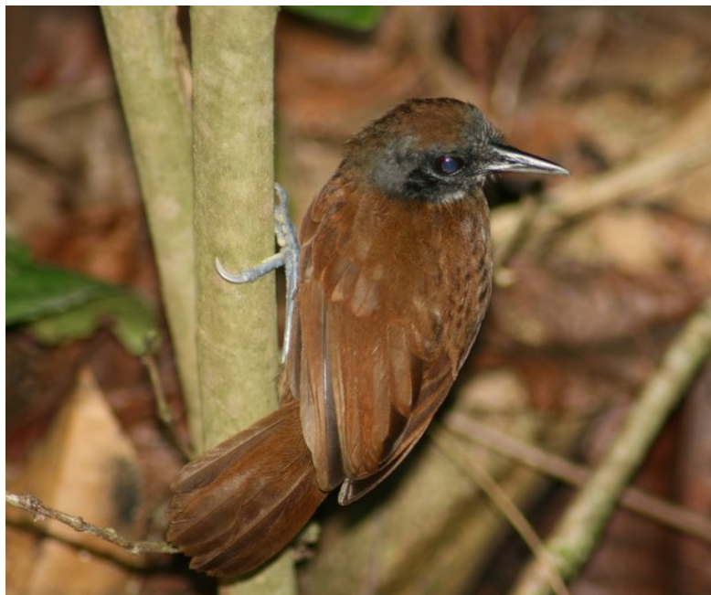
Above: Bi-coloured Antbird

There was no carnival of colour today, at least not for the first few hours, as a dank morning in the foothills along the Rio Indio y Jordanal did not just subdue the plumages of the birds, it squashed them flat. The light was so poor that even as good a bird as Spot-crowned Barbet was rendered null and almost void. Being closer to the ground helped, and in that respect a lovely Long-tailed Tyrant put on a welcome display. A pair of Plumbeous Kites tried to lighten things up, but their name kind of said it all, and as for Jet Antbird! Still, we saw these birds and that was what mattered. We did begin to wonder, though, where any colour was to be found. Thankfully, Red-throated Ant Tanager was on hand to glow in the gloom, a fine species that had not shown this well previously. Then came the bird of the day, another that I did not think was on the shortlist. It was knife's edge stuff as they came in closer and closer in response to Dani's i-pod but stayed well hidden. Then, there they were, the menacing looking Barred Puffbird. Being quite unlike the other members of their family that we had encountered, they were a must to see, and once they had arrived they stayed on show for some time, calling to the unseen intruder. A Green Kingfisher turned up near the bus as we prepared to retreat, and a Black-headed Tody Flycatcher was a lucky addition for those looking in the right direction.