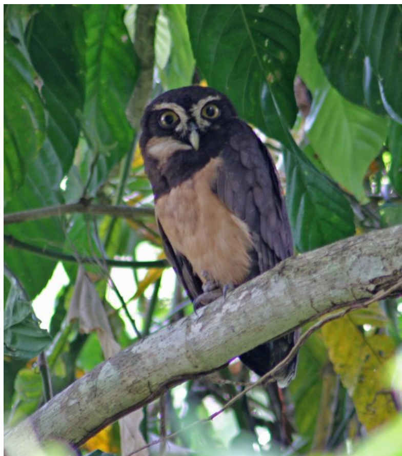
Above: Spectacled Owl

Leaving the ponds, a large dark shape was disturbed in the trackside understory. Further investigation revealed an impressive Collared Forest Falcon intent on catching some prey. It therefore took no interest in us as it peered at the forest floor allowing us to watch it going about its life at our leisure. It was quite hot now and little brown or olive jobs were not holding the attention for long. But Alexis, our guide, was merely toying with us as he led us towards two absolute crackers. Firstly he presented the much-wanted Spectacled Owl, which sat almost unblinking a few meters away on an exposed limb as our cameras snapped away - an unforgettable encounter. The owl was a bird often mentioned as being 'staked out' for tourists, and thus half expected. The next however certainly wasn't, as a little way down a side-track, we found ourselves staring in disbelief at a nesting Rufous Nightjar and chick, the tiny ball of fluff sitting tight under its parent's chin. What could we say? Another walk away 'lifer' of the highest quality: lunch was going to taste pretty good.