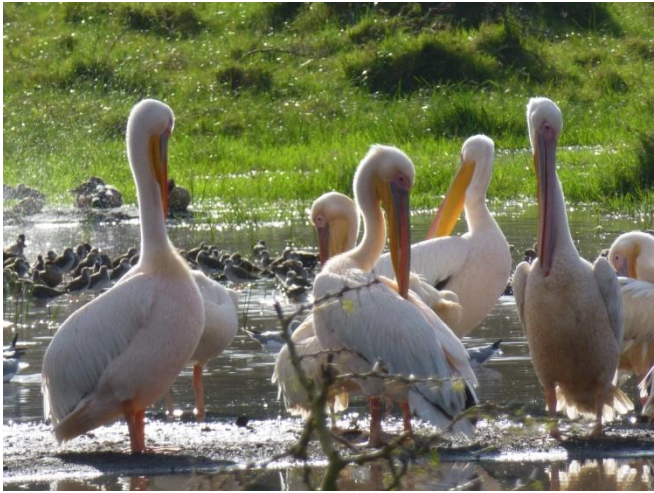
Great White Pelican