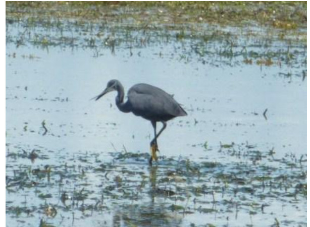
Western Reef Heron