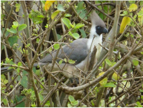
Bare-faced Go-away Bird