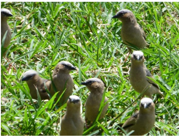
Grey-capped Social Weaver