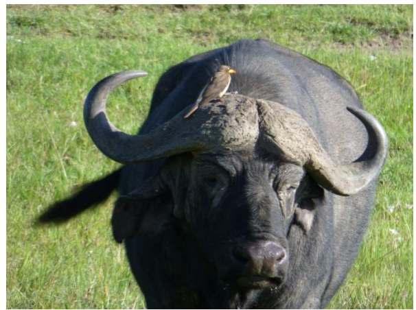
Yellow-billed Oxpecker (and Cape Buffalo!)