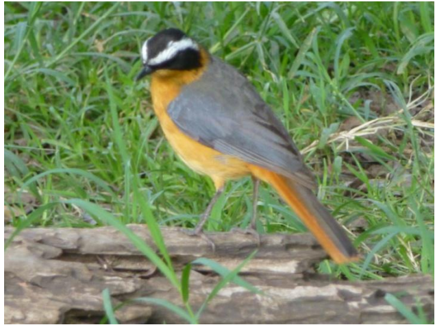
White-browed Robin Chat