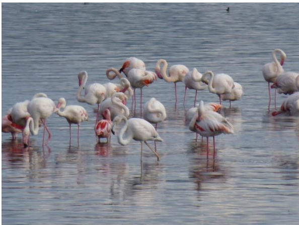
Greater Flamingo and Lesser Flamingo (only a couple of thousand present as opposed to four million plus on my previous visit)