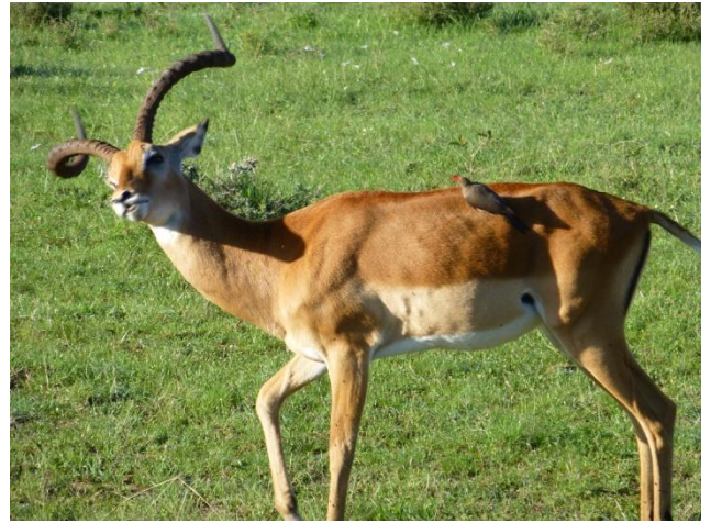
Red-billed Oxpecker (and Impala)