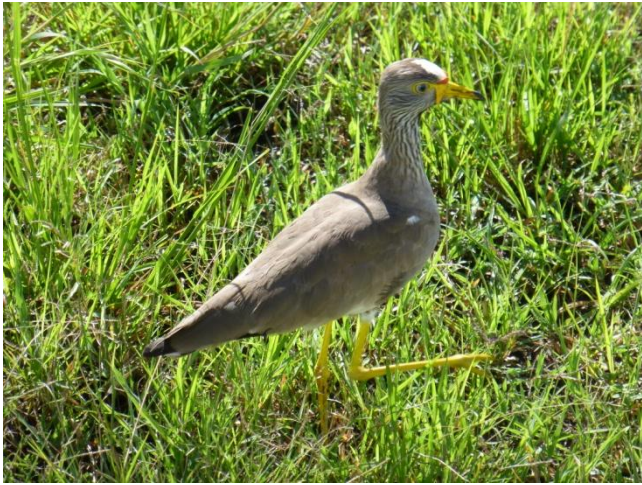
African Wattled Plover