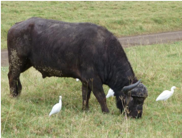
Cattle Egrets (and Cape Buffalo!)