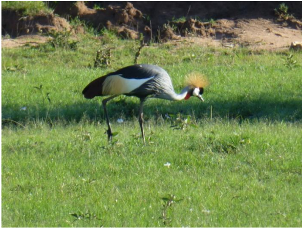
Grey Crowned Crane