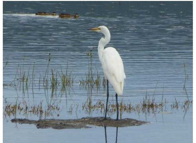
Great White Egret