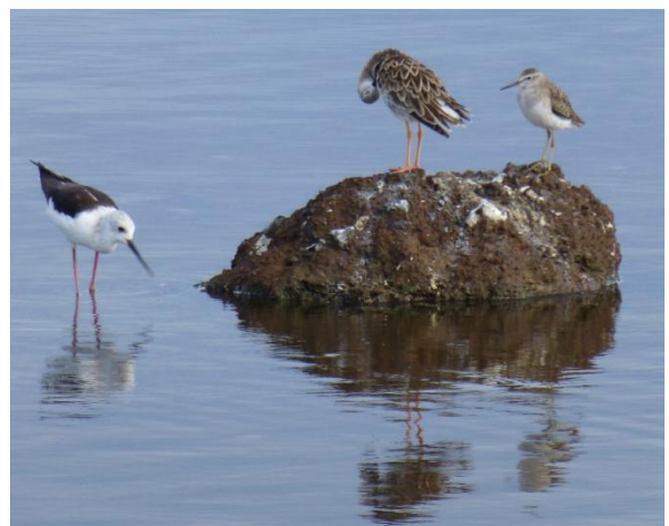
Black-winged Stilt, Ruff, Wood Sandpiper