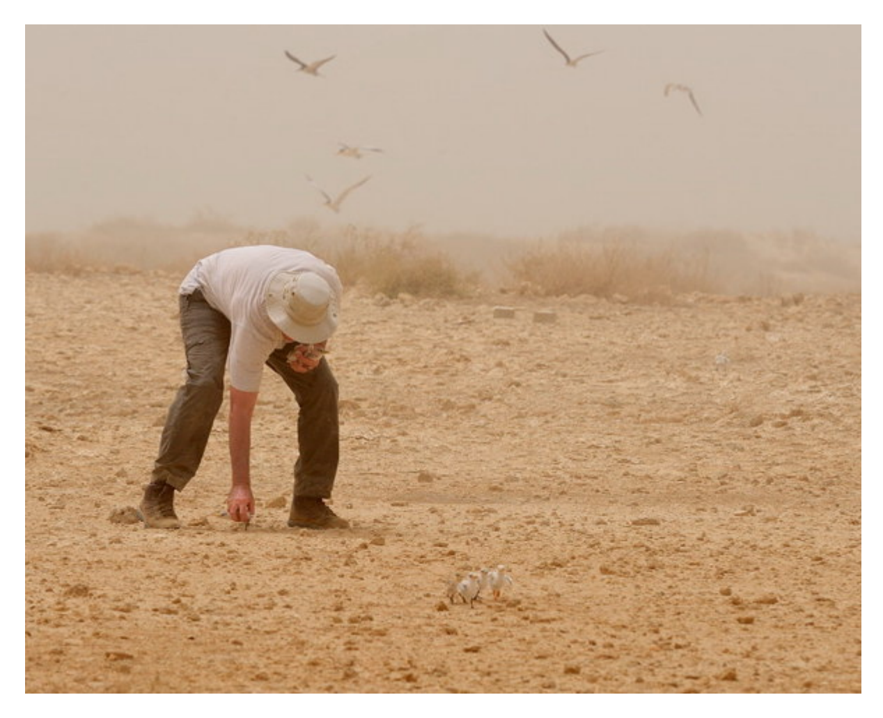
Below: the chicks gathering after a 'mass' release