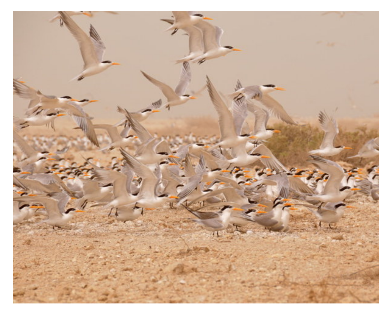
Below: Lesser Crested Terns escorting their young back to the creche