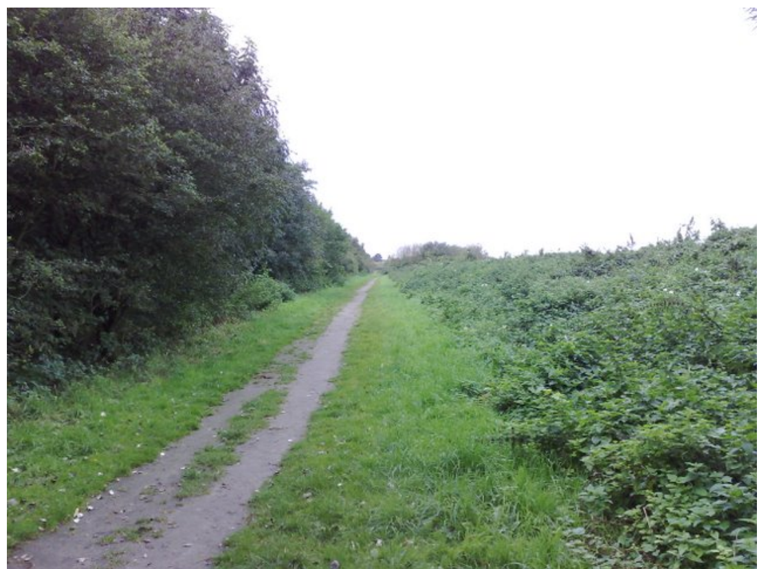
Above: The main path in between the lakes (to the left of picture, hidden behind the trees) and the southern edge of the settling beds (to the right). The area over the nettles on the right is number 1 bed, home of the 2007 Grey Phalarope that entertained so many county birders during it's stay.