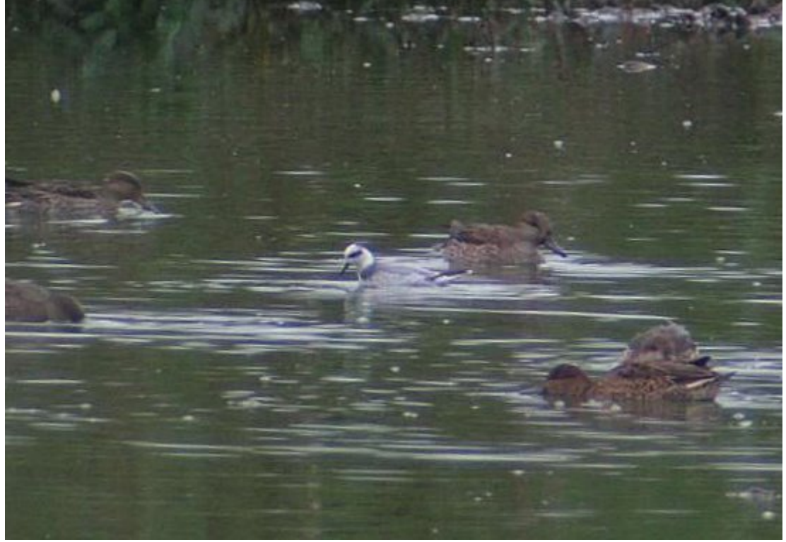
Above: Proof that Hope Carr can still produce the goods and is to be ignored at your own peril, the 2007 Grey Phalarope feeding with Common Teal.