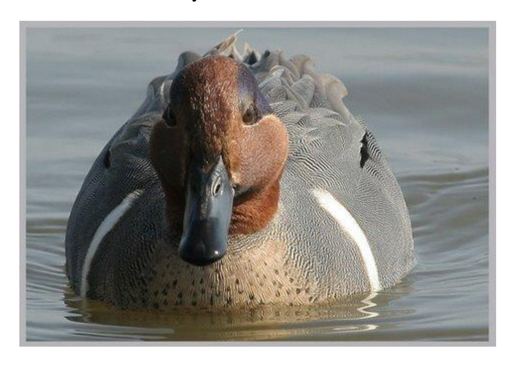
Drake Green-winged Teal at Marshside, Merseyside

Green-winged Teal ( Anas carolinensis ) is the American counterpart of our own Eurasian Teal ( Anas crecca ) and was formerly considered to be merely a race of the latter but in December 2000 it was given full specific status by the British Ornithologists' Union's Records Committee, with the American Ornithologists Union adopting the same split in 2002.