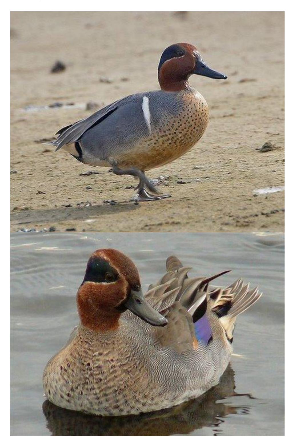
Above: Green-winged Teal (left) at Marshside, Merseyside and Eurasian Teal (right) at Pennington Flash, Greater Manchester.

The creamy lines around the green face patches on Eurasian Teal are usually evenly conspicuous and broad, whereas those on Green-winged are very poorly marked and faint with usually only a creamy line under the eye and crescent in front of the bill.