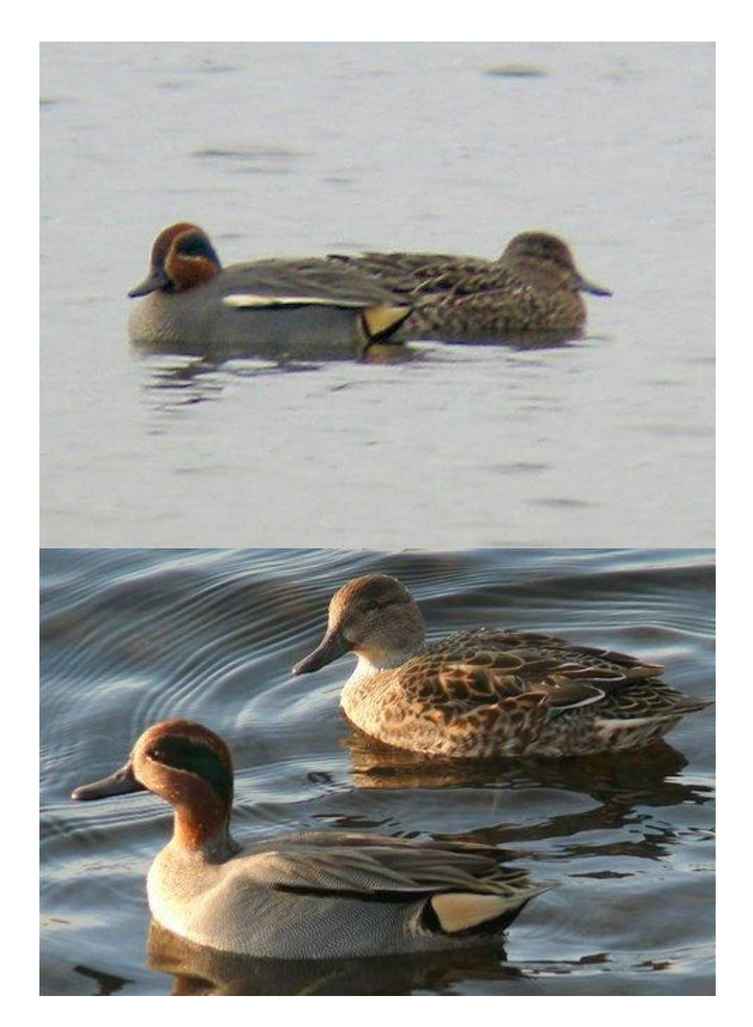
Above: (top image) Drake Eurasian Teal with female Green-winged Teal at Fernhill Wetlands, Forest Grove, Oregon, USA and (bottom image) male and female Eurasian Teals at Pennington Flash, Greater Manchester.

Is there enough to confidently separate the above two female Teal from their facial patterns in these images alone, let alone convince a rarity committee? It shall be a brave birder who claims the first anyway! Note here, the horizontal white stripe above the flanks on the drake Eurasian Teal on the bottom image is indeed being concealed by feathering apart from a very inconspicuous 'sliver' towards the rear.