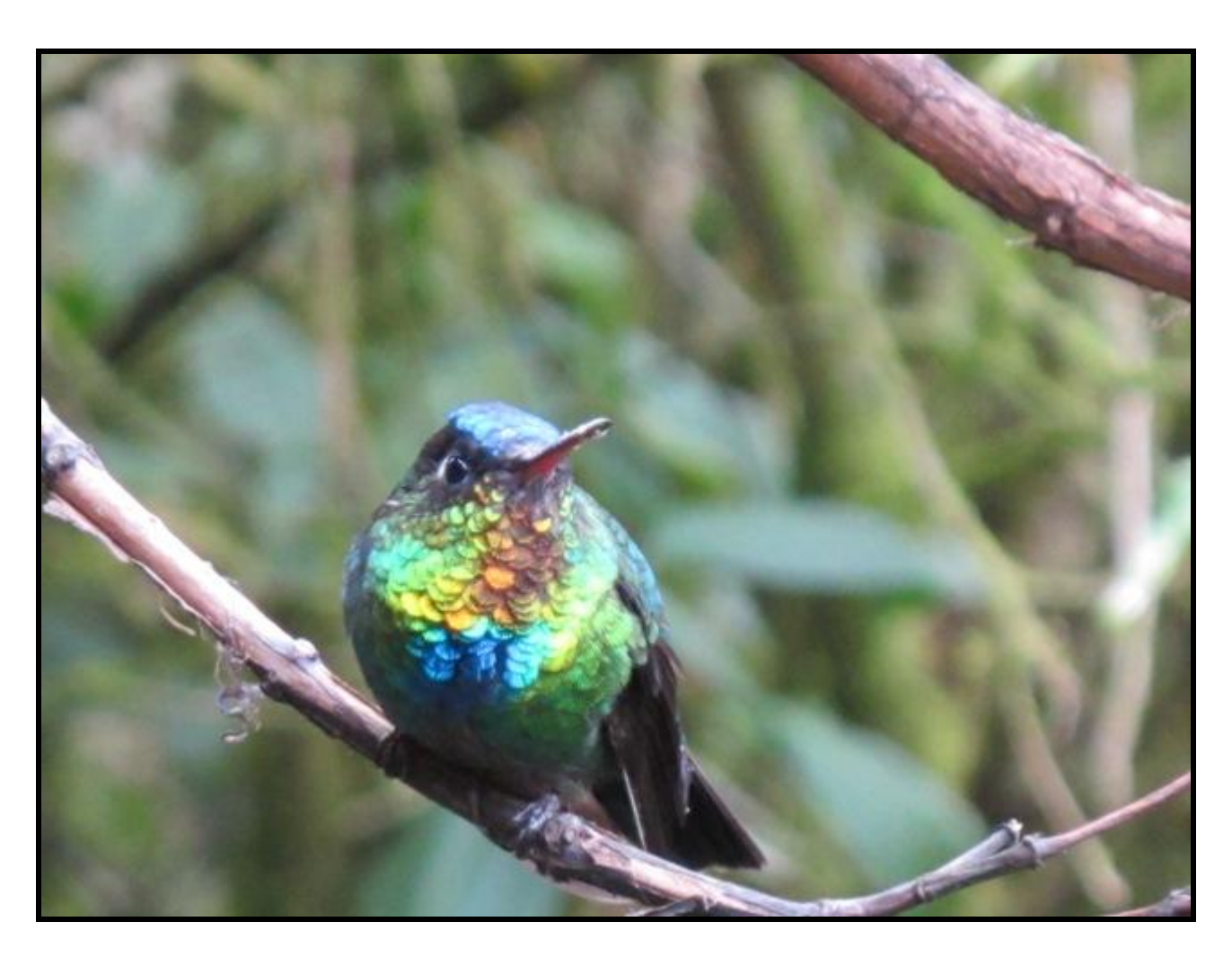
Fiery Throated Hummingbird