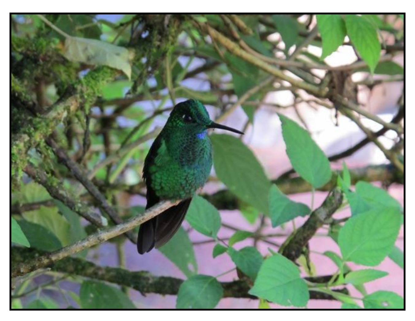
Green Crowned Brilliant