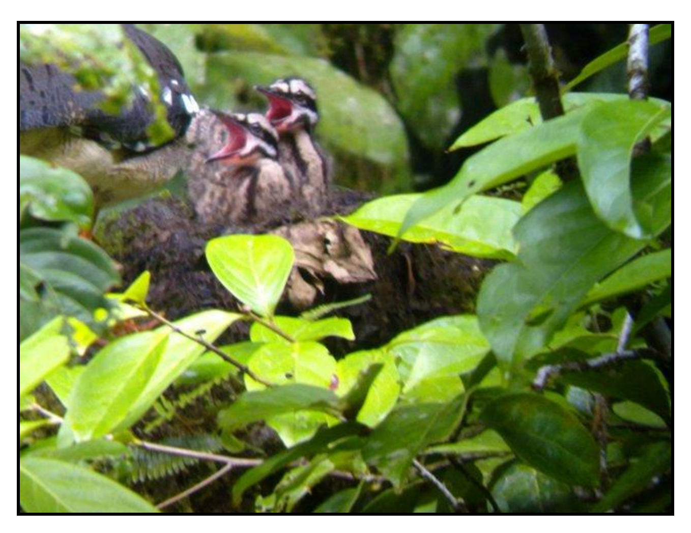
Sun Bittern chicks

On the Rancho Naturlista land the highlights are the Hummingbirds that visit the garden (and the nearby owner's garden, which guests kindly have full access to). We saw 16 species, including, Green Breasted Mango, Green Thorntail, Garden Emerald and a migrant Ruby-Throated Hummingbird. In the nearby forest we also had the elusive Purple Crowned Fairy. The absolute star bird, one of the highlights of the whole trip, was the Snowcap. Stunning views were had whilst reclining in garden chairs in the owner's garden and watching birds bath in forest pools as the sun went down! The forest around Rancho held a variety of special birds, highlights included Violaceous Trogon, Spotted Barbtail, Tawny Throated Leaftosser, Slaty Antwren, Thicket Antpitta, spectacular White-Collared, White-Ruffed and White-Crowned Manakins (including lekking birds), Piratic Flycatcher and Black-Headed Nightingale-Thrush (amongst many many others!).