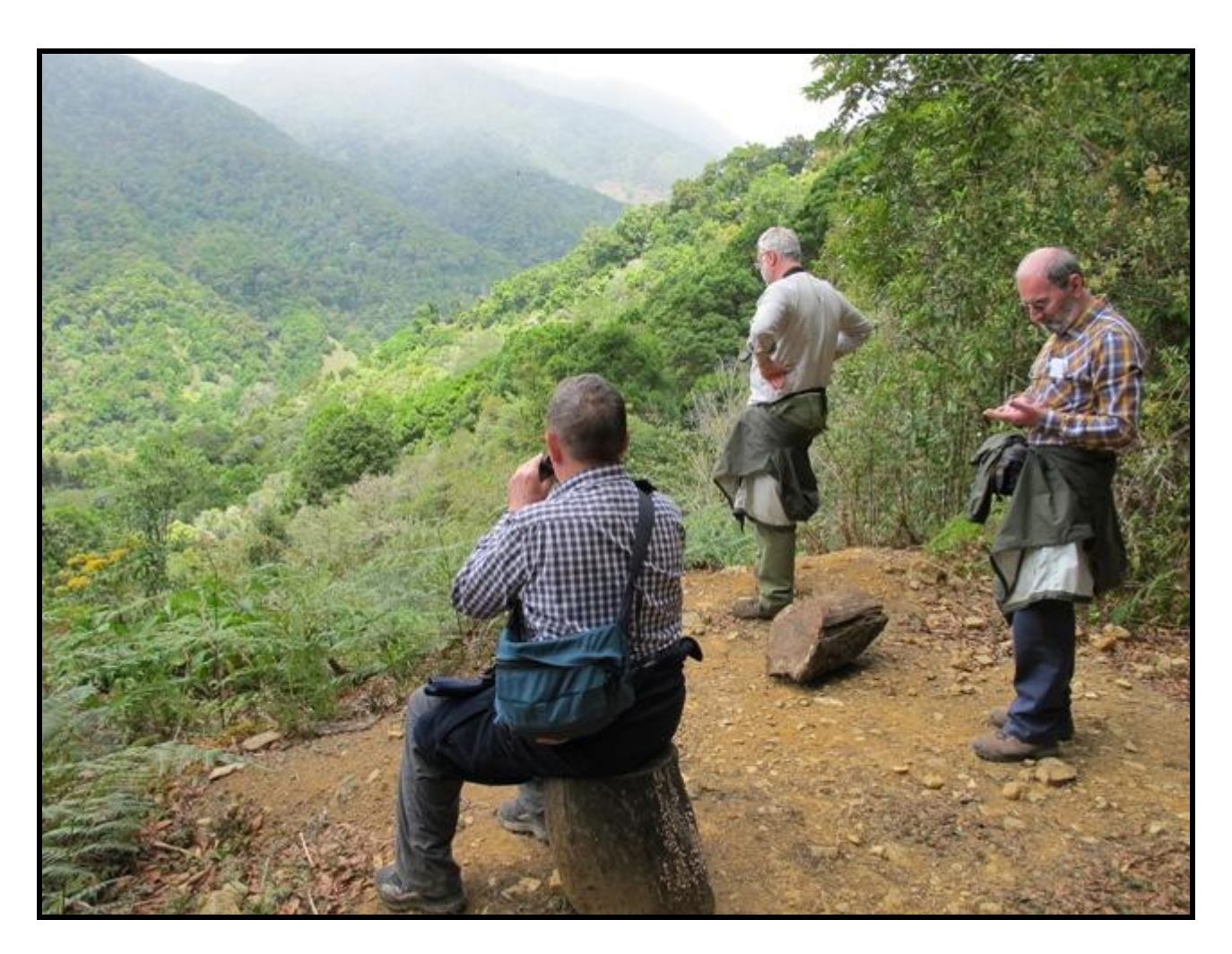
It landed in the tree...which bloody tree?!!