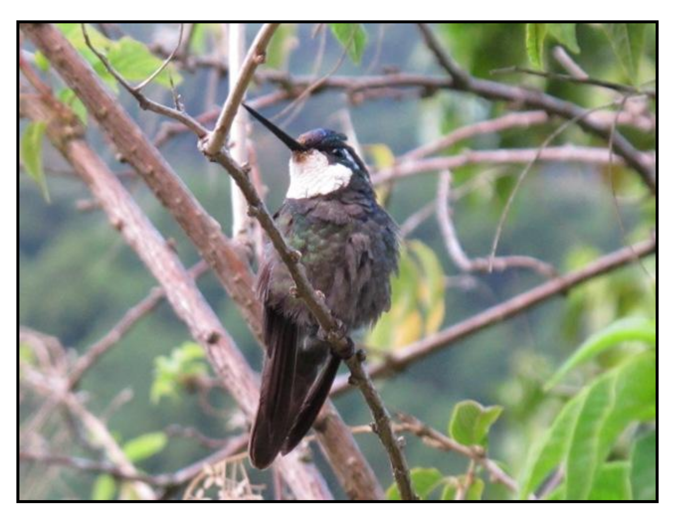
White Throated Mountain Gem

10<sup>th</sup> March 2012 – 11<sup>th</sup> March 2012 – Hotel Buena (travel day)