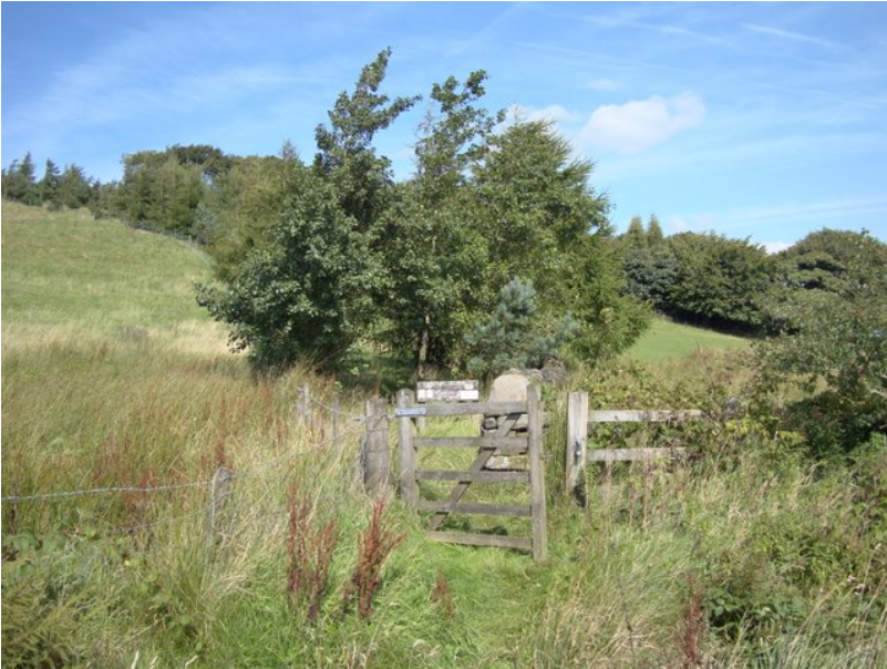
The entrance to Lomax Wife's Plantation. With excellent cover for migrants a footpath leads up through this small plantation.