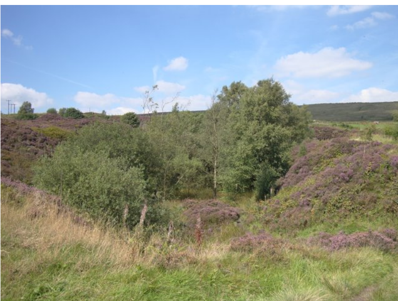
Lying off Collier's Row Road, immediately on the eastern side of the small row of cottages there, Brownstone's Quarry (more often simply called Collier's Row Quarry) is very sheltered and can harbour migrants. The quarry suffers some minor disturbance from climbers but it very rarely has any negative effect on the birds in there.