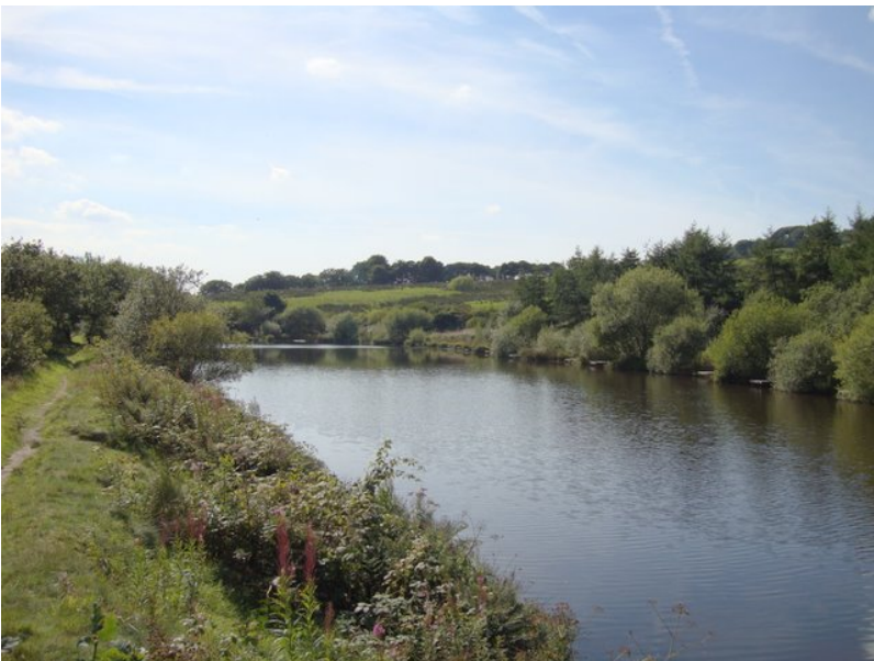
Bryan Hey Reservoir is a small area of water running parallel with Scout Road. It is surrounded by Hawthorn hedges, Sallows and other trees and despite only really being realised as a viable birding location in August 2010 has already proved very productive.

Ian McKerchar, December 2009 (revised October 2010)