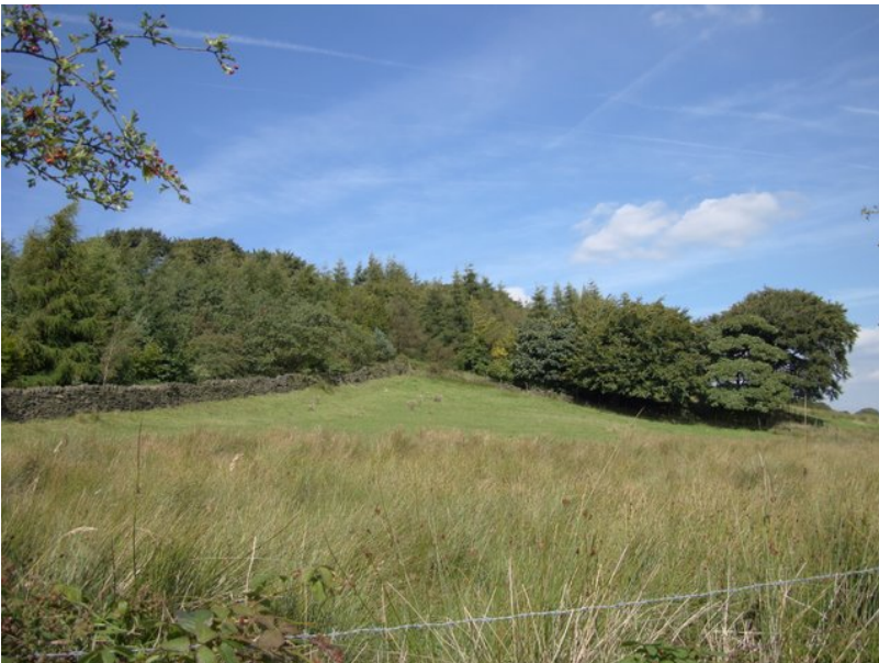
Viewing Lomax Wife's Plantation from Coal Pit Road is often the best option and the stone wall along its southern edge here and fence line along its northern edge can be rewarding.