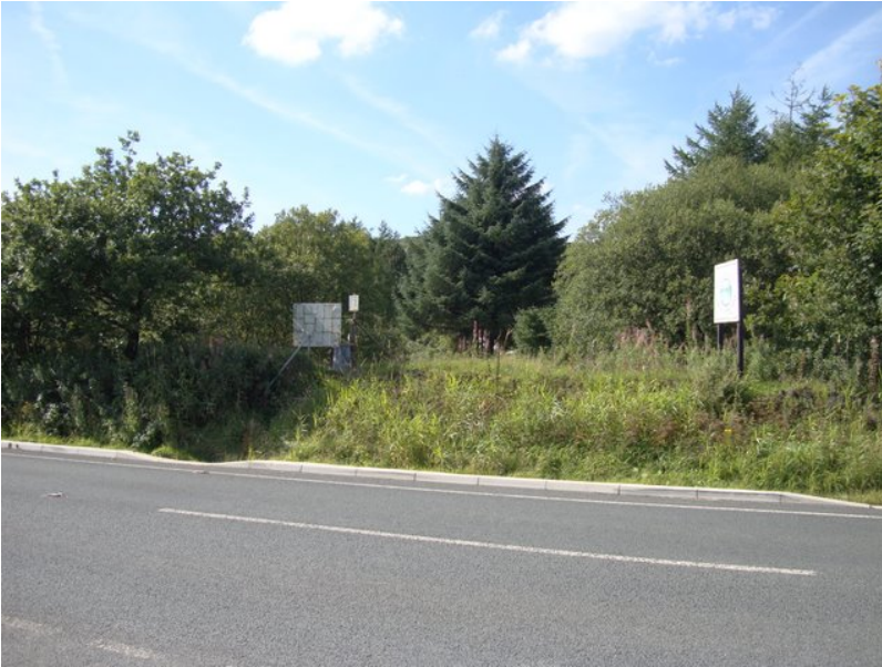
The entrance to Bryan Hey Reservoir off Scout Road, just opposite Horrocks Fold car park.