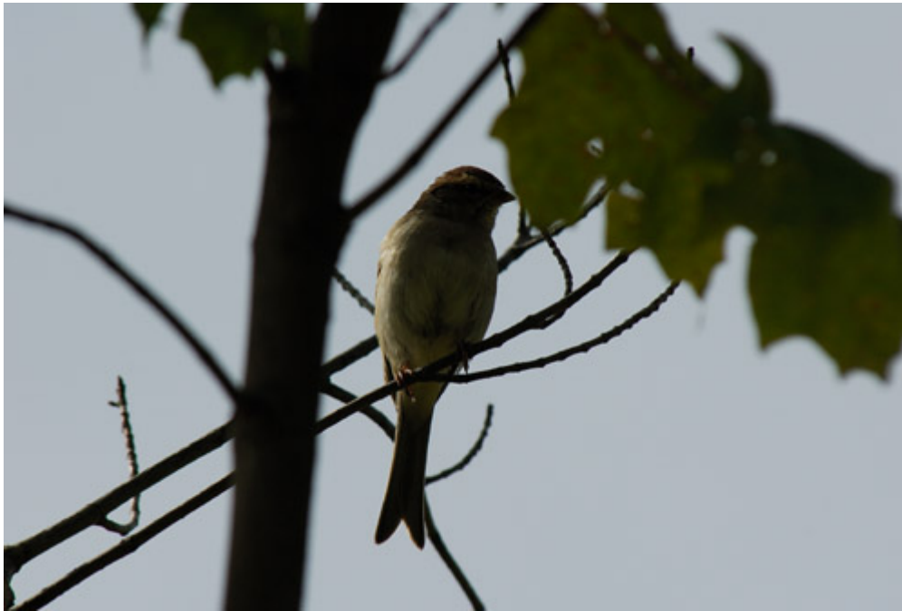
Chipping Sparrow, Adirondacks, September 2009

A walk around the Paul Smith reserve failed to produce any Moose though 1 Pileated Woodpecker, Belted Kingfisher, White-throated Sparrow and a very photogenic Chipmunk seen.