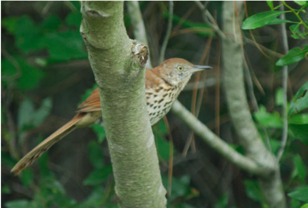
Brown Thrasher (above) and juvenile American Robin (below), Assateague, August 2009

The north end of Assateague Island was fairly quiet though American Redstart, Great Crested Flycatcher, Northern Oriole, Brown Thrasher, Eastern Kingbird and a juvenile American Robin seen around the scrubby areas along with several Sika and White-tailed Deer.