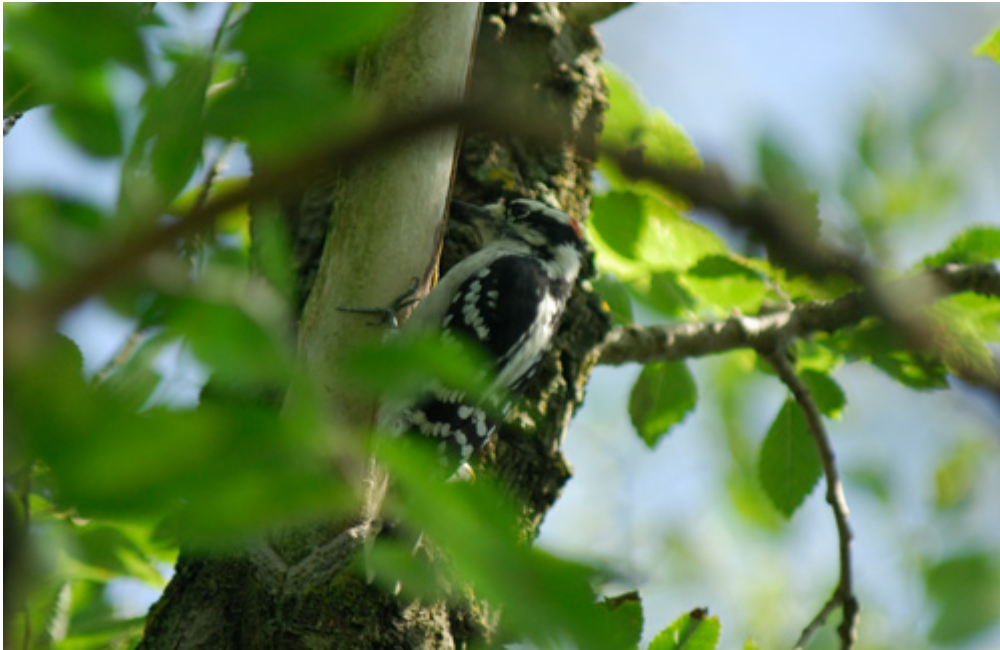
Downy Woodpecker (above) and Mourning Dove (below), Cape May, September 2009