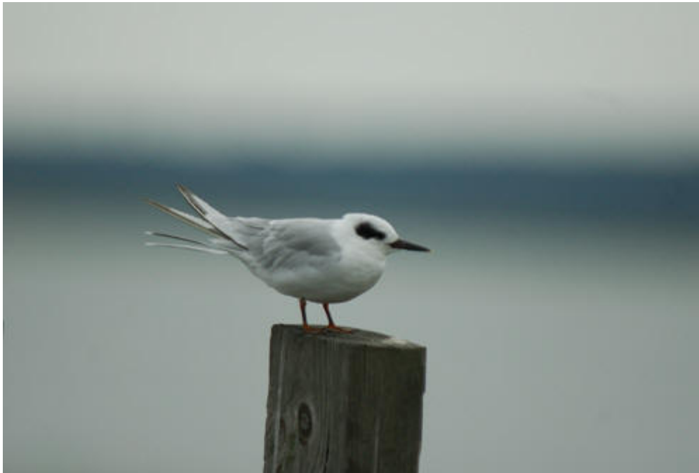
Forster's Tern (above) and Snowy Egret (below), Assateague, August 2009