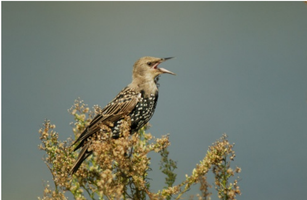
Juvenile Starling (above) and first winter male Red-winged Blackbird (below), Edwin B Forsythe Reserve, September 2009