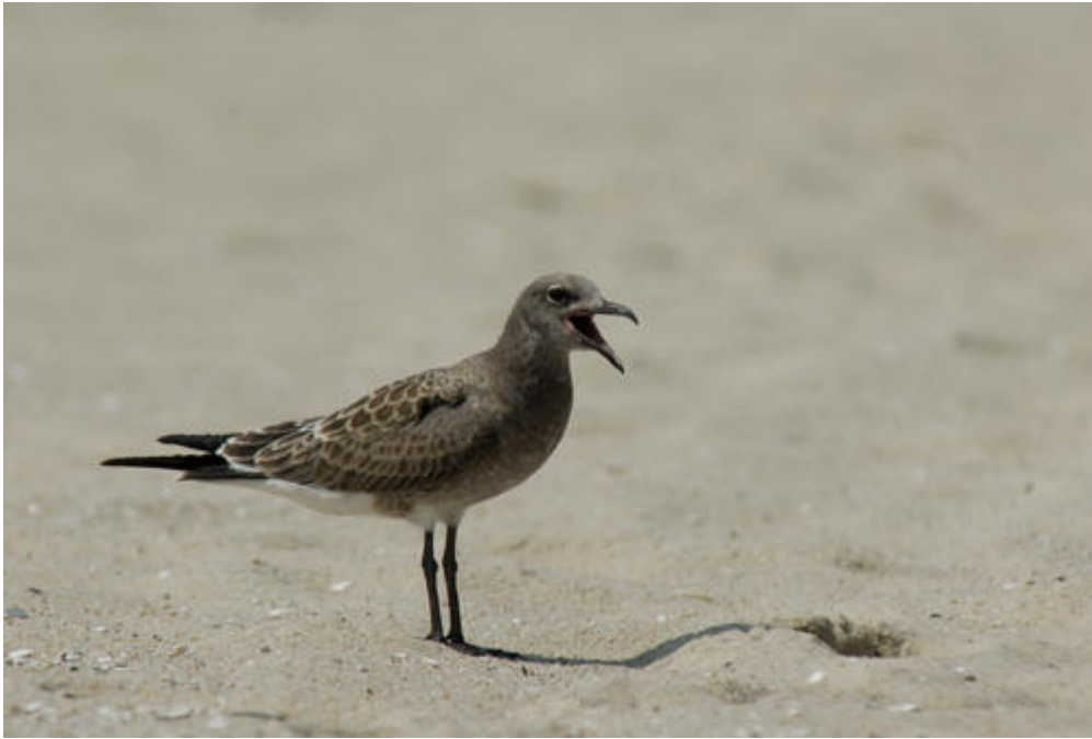
Juvenile Laughing Gull (above) and Royal Tern (below), Cape May, August 2009

Peregrine and a distant adult Bald Eagle. Many terns and gulls on the beach including many Laughing Gulls and Forster's and 3 Royal Terns but were flushed by the increasing number of sun worshippers.