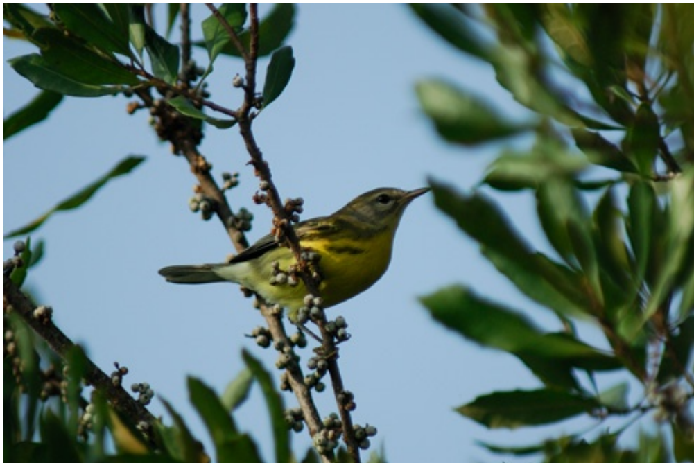
Female Prairie Warbler (above) and female/immature Yellow-rumped (Myrtle) Warbler, Cape May, September 2009