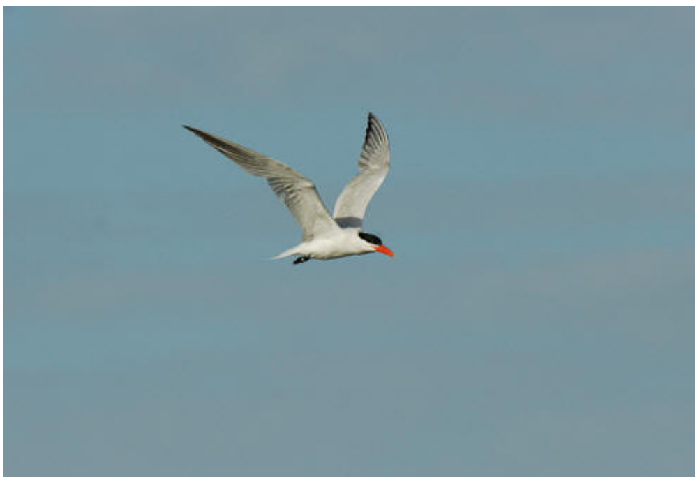
Caspian Tern (above) and Red-winged Blackbird (below), Assataegue, September 2009