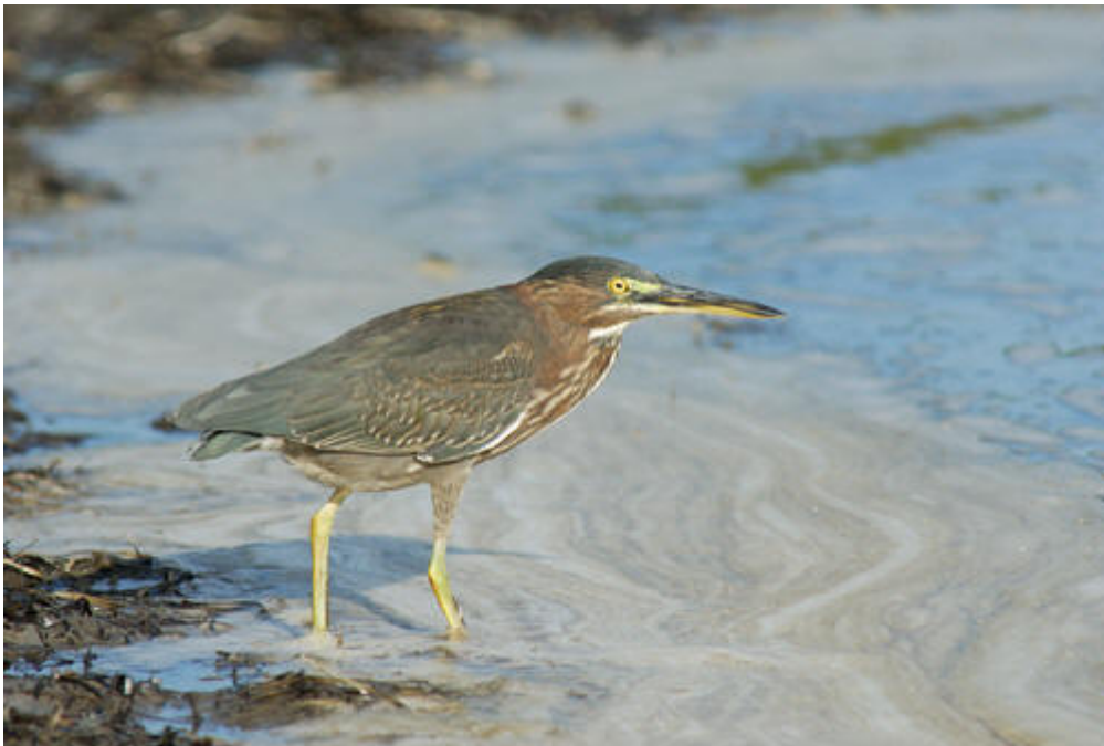
Green Heron (above) and Tricolored Heron (below), Assataegue, September 2009