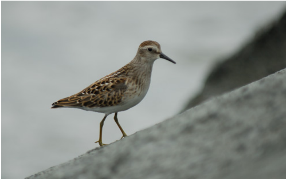
Juveniles of Least Sandpiper (above) and Semipalmated Sandpiper (below), Cape May, September 2009

A return visit at midday showed an empidonax sp in the scrub and American Kestrel, Osprey and Turkey Vulture overhead. A short visit to Douglas Park showed 2 Blue Grosbeaks, 2 American Goldfinches and several Northern Mockingbirds in the scrub by the road and Cliff Swallow, Purple Martins and Tree Swallows overhead and on wires. 3+ confiding Least Sandpipers and 1+ Semi-palmated Sandpipers present on the breakwater allowing excellent photographic opportunities.