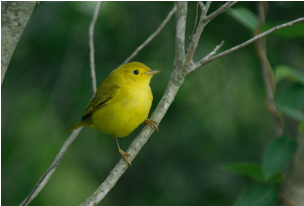
Yellow Warbler (above) and Common Yellowthroat (below), Cape May, September 2009