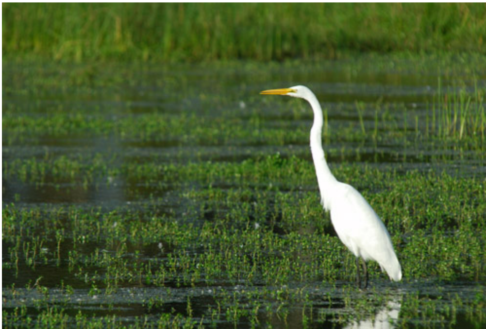
Great White Egret (above) and White Ibis (below), Assataegue, September 2009