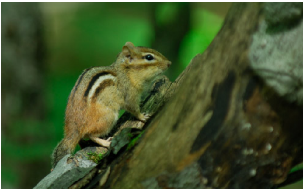
Chipmunk, Adirondacks, September 2009

A walk around the Paul Smith reserve failed to produce any Moose though 1 Pileated Woodpecker, Belted Kingfisher, White-throated Sparrow and a very photogenic Chipmunk seen.