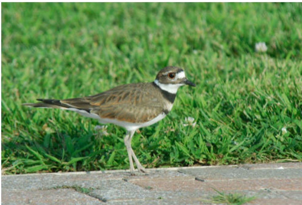
Killdeer, Cape May, August 2009

Nearby, several Killdeers around the ferry terminal early evening showed well on the grassy areas.