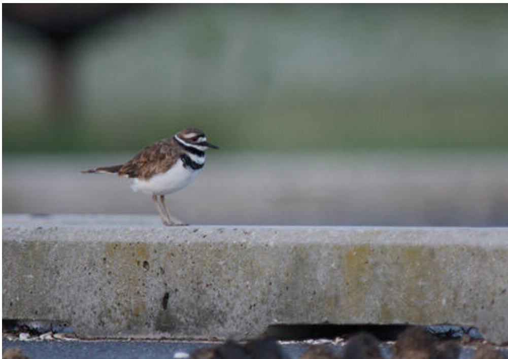
Killdeer (above) and Northern Mockingbird (below), Assataegue, September 2009