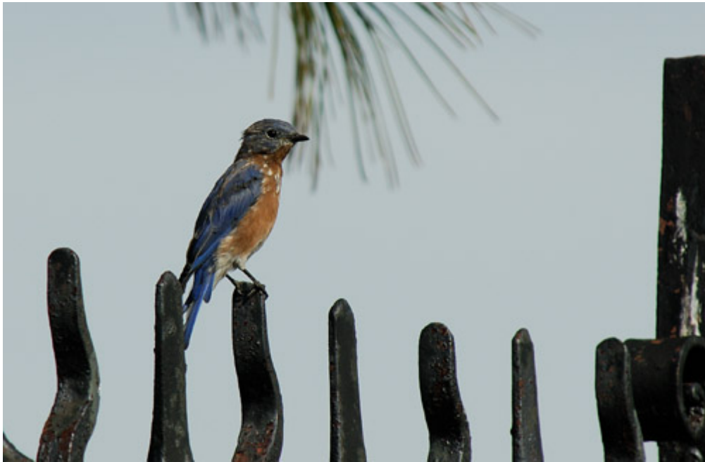
Eastern Bluebird (above) and Pine Warbler (below), Adirondacks, September 2009