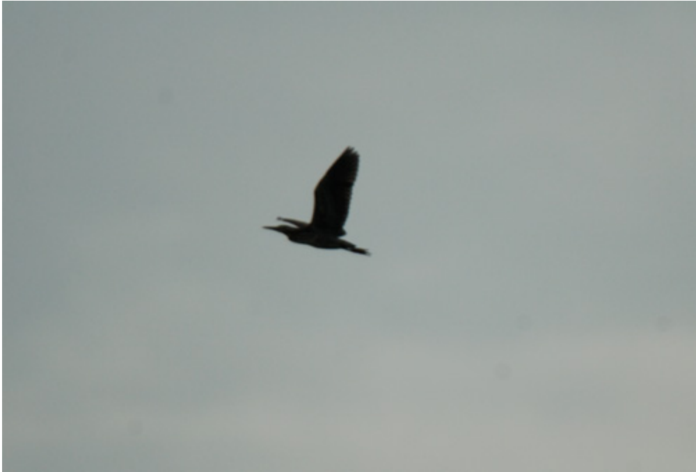
American Bittern, Cape May, September 2009

Many gulls on the beach, mostly Greater Black-backs and American Herrings but also single Lesser Black-back and 2 Ring-billed Gulls with a few Bottlenose Dolphins offshore.