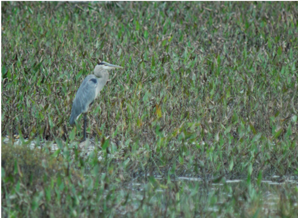
Great Blue Heron, Adirondacks, September 2009