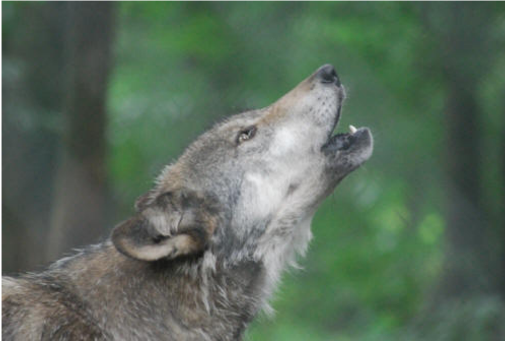
Wolves, Lakota, August 2009

The morning spent photographing four packs of Wolves and 2 Bobcats in enclosures at the Lakota Wolf Sanctuary, though the poor light and chainlink fencing not making for easy photography.