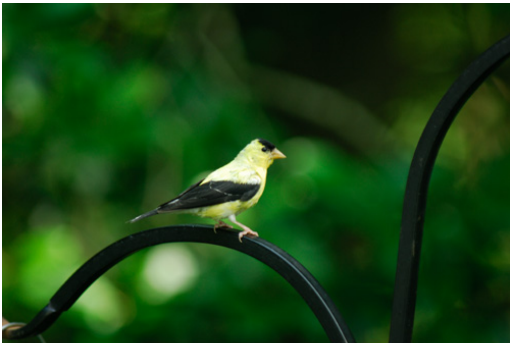
American Goldfinch (above) and Tufted Titmouse (below), Cape May, September 2009