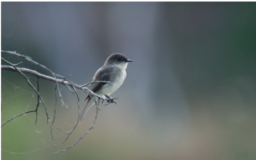
Eastern Phoebe (above) and Carolina Chickadee (below), Wharton, September 2009

An evening stake out for Beaver in Wharton State Forest drew a blank though a couple of parties of Pine Warblers, 2+ Eastern Phoebes, Carolina Chickadee, White-breasted Nuthatch and 2 Wild Turkeys seen.