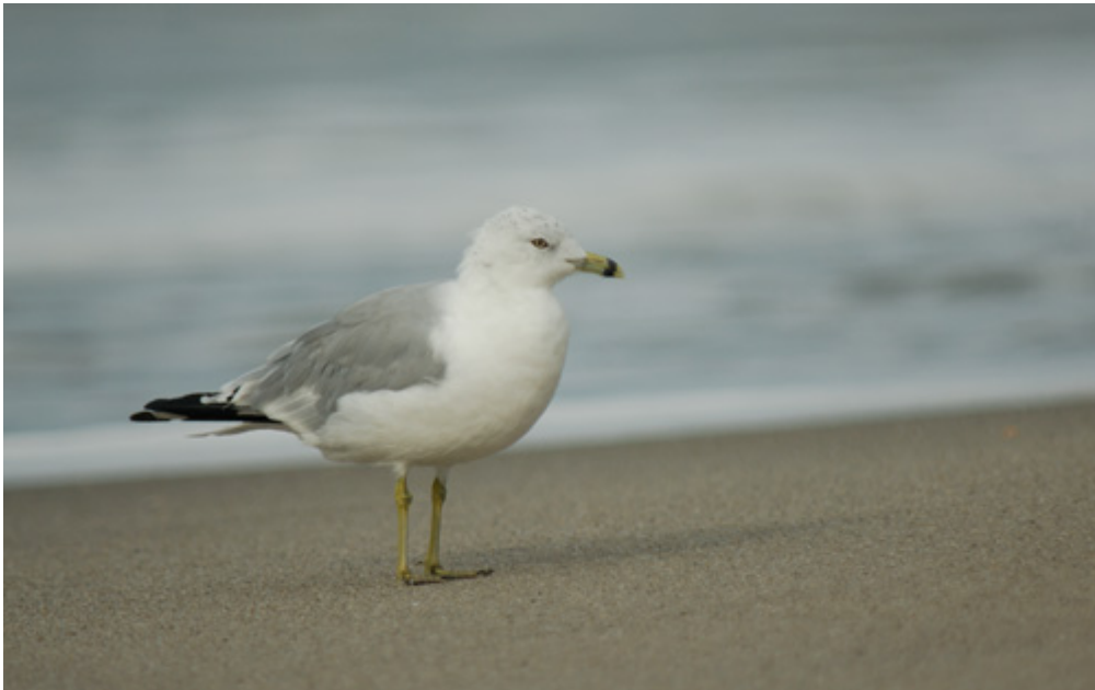
Ring-billed Gull (above) and juvenile American Herring Gull (below), Cape May, September 2009

Many gulls on the beach, mostly Greater Black-backs and American Herrings but also single Lesser Black-back and 2 Ring-billed Gulls with a few Bottlenose Dolphins offshore.