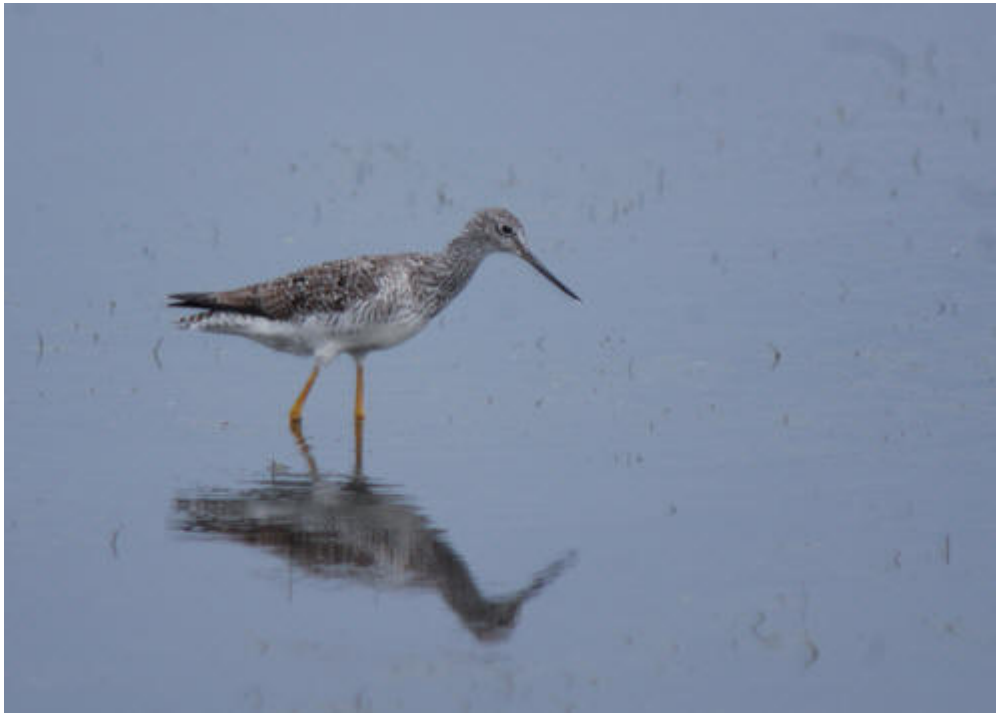
Adult Greater Yellowlegs, Assateague, August 2009

A roost of Willet and Marbled Godwit at the beach end of the wetland, along with many Black Skimmers though again fairly distant. Also Northern Bobwhite, Downy Woodpecker and a party of a dozen American Robins seen in the park.