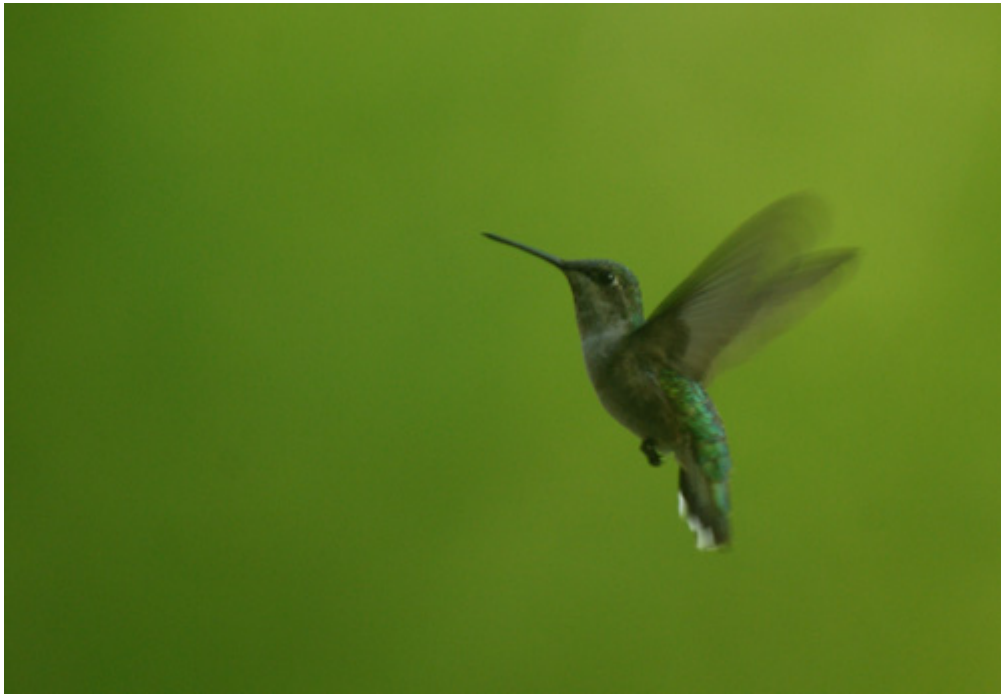
Red-throated Hummingbird (above), Cape May and Chipmunk (below), Warton, both September 2009