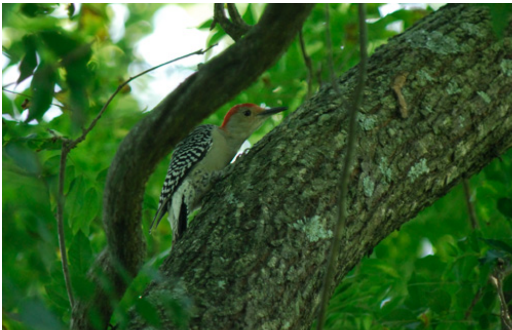
Red-bellied Woodpecker (above) and Red-throated Hummingbird (below), Wharton, September 2009

Many American Robins on the lawn by the nature visitor centre along with 1+ Northern Flicker, Red-bellied Woodpecker in the trees and c.10 Ruby-throated Hummingbirds coming to feeders.