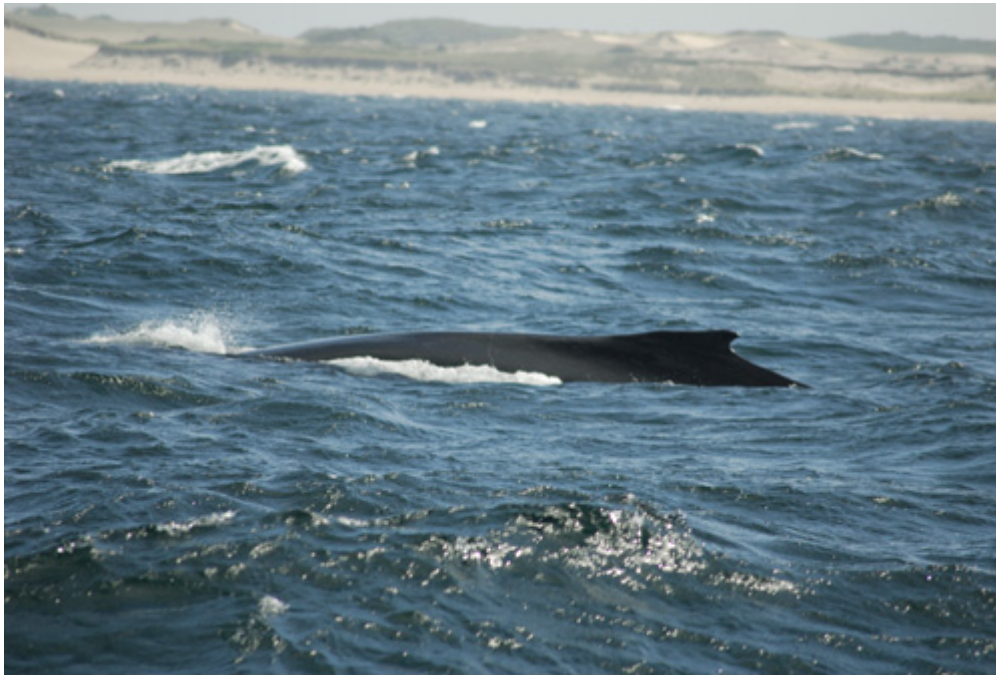
Humpback Whale, Cape Cod, September 2009

Also several Great, 2+ Sooty and 1 Cory's Shearwaters and 2 Wilson's Petrels seen.