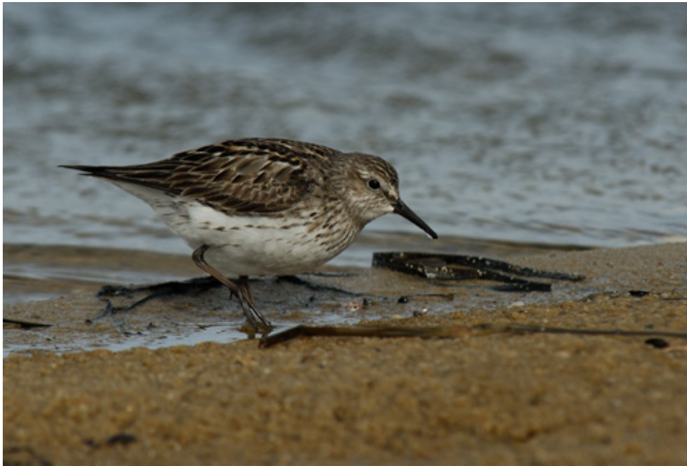
Adult White-rumped Sandpiper and juvenile Semipalmated Sandpiper, Cape Cod, September 2009