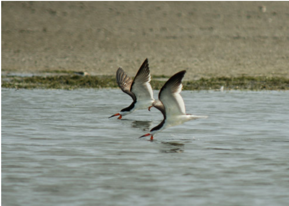
Black Skimmers (above) and Forster's Tern (below), Assataegue, September 2009

A return to the south end produced the same assortment of herons, egrets, ibis, terns, waders and Black Skimmers on the marsh as yesterday.