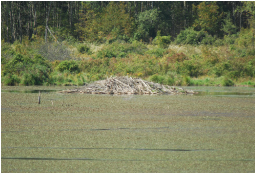
Beaver Dam, Allegheny, September 2009

A probable Broad-winged Hawk flew over Route 80 mid afternoon as did a Sharp-shinned Hawk that caught a passerine above the carriageway.