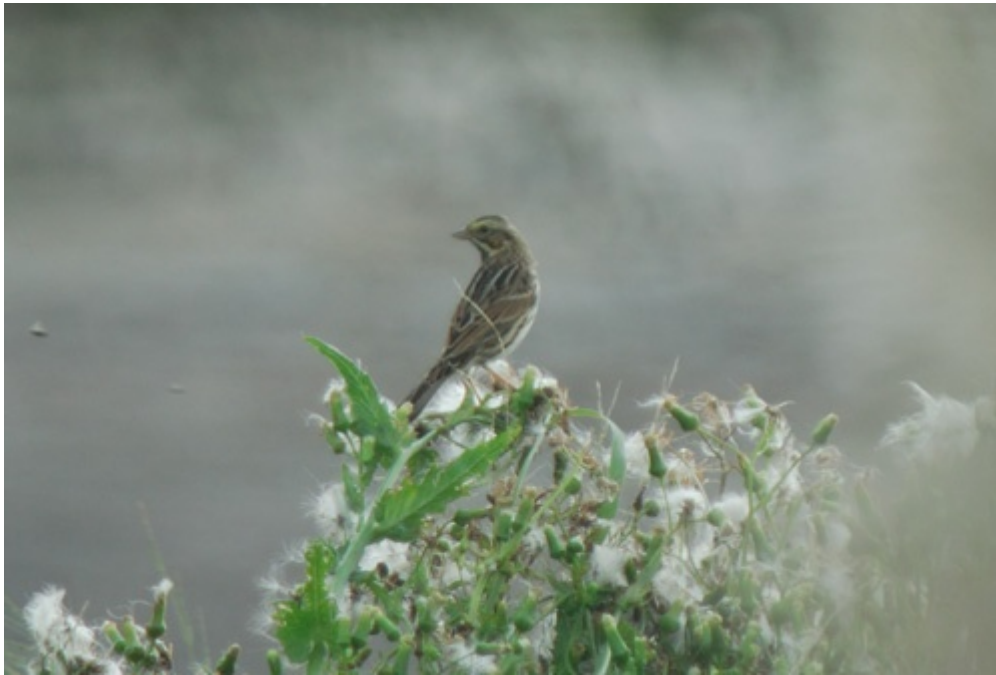
Savannah Sparrow, Edwin B Forsythe Reserve, September 2009