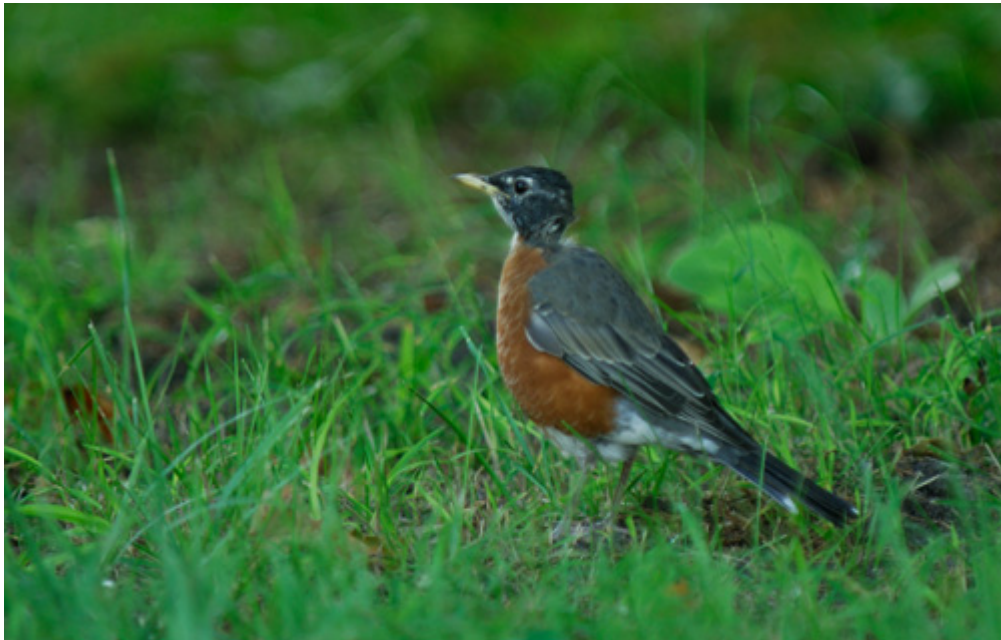
American Robin, Wharton, September 2009