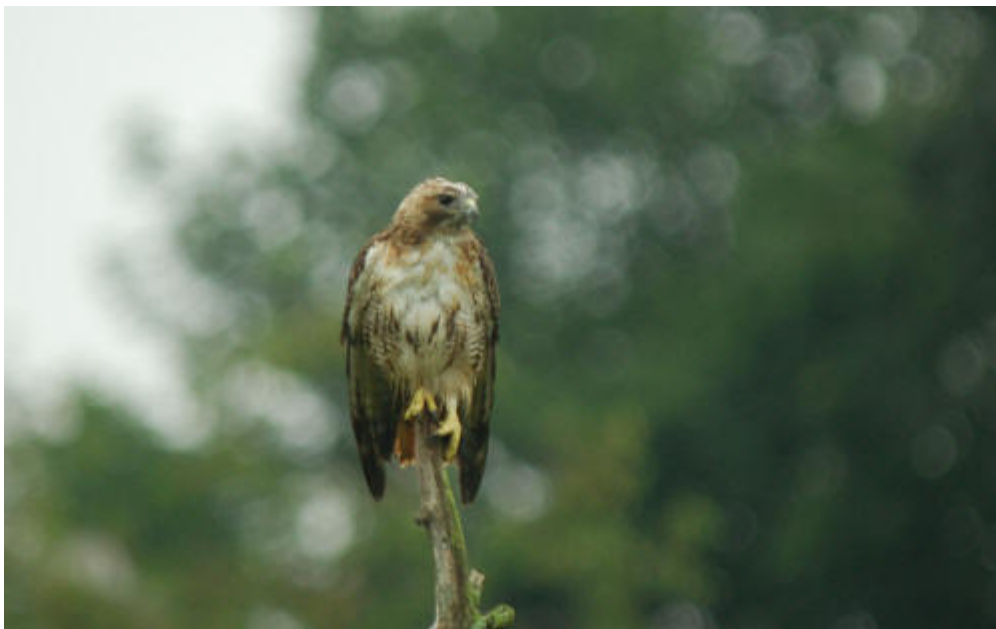
Red-tailed Hawk, Lakota, August 2009

One Bobcat ran across the road in front of us in the Delaware Gap National Recreation Area before disappearing into the trees, a most unexpected sighting. Unfortunately, a short search showed no further sign but several Grey Catbirds, a Downy Woodpecker, female Ruby-throated Hummingbird and a male Northern Cardinal seen. Several Black-capped Chickadees and a probable Palm Warbler at nearby Ramonskill Falls and many Tree Swallows, Swallows and a Cedar Waxwing hawking over the river behind the campsite late afternoon. Nearby, 2 Red-tailed Hawks showed well perched by the road.