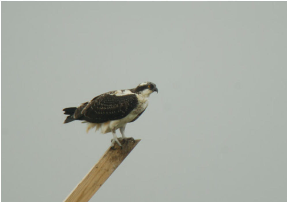
Osprey, Edwin B Forsythe Reserve, September 2009