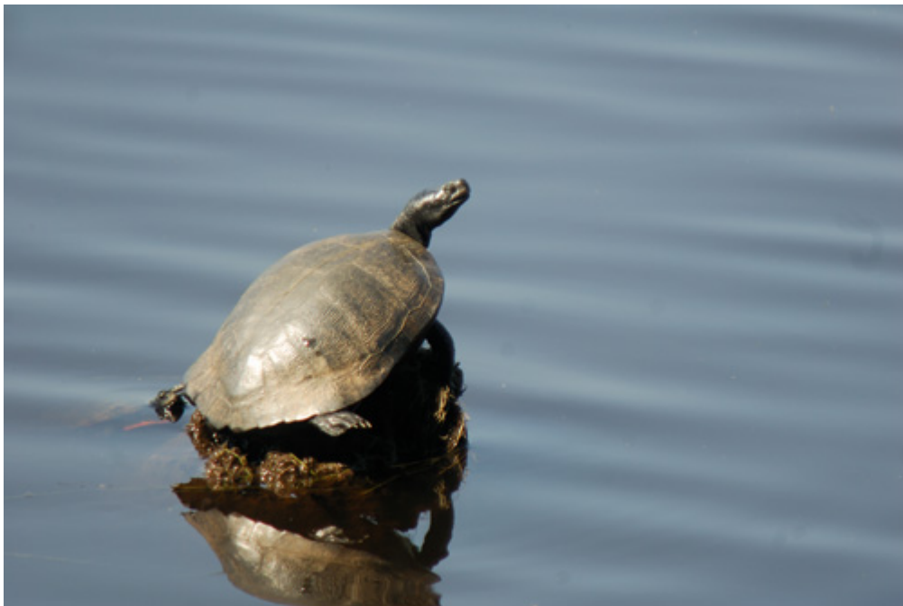
Red-bellied Turtle, Wharton, September 2009

Also 2 White-breasted Nuthatches feeding off picnic tables along with Eastern Bluebird and Eastern Phoebe in the area.