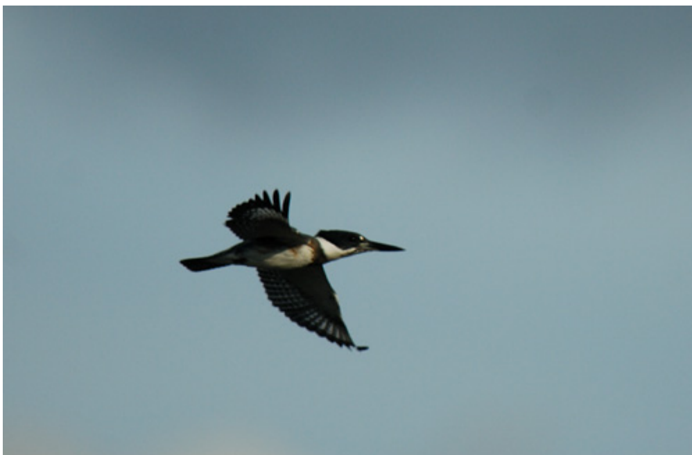
Belted Kingfisher (above) and House Sparrow (below), Cape May, September 2009

A general drive around Cape May produced single Red-shouldered Hawk and a juvenile Cooper's Hawk in the morning. A late afternoon walk around the Meadows was fairly quiet with possibly the same juvenile Cooper's Hawk as earlier, 1 American Redstart and a probable Yellow Warbler in the scrub. 1 eclipse male Wood Duck on the marsh along with several Blue-winged and Green-winged Teals, 2 Killdeer, Lesser Yellowlegs, a flypast Belted Kingfisher and a posing House Sparrow.