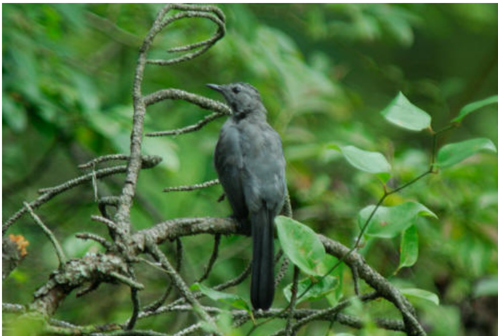
Grey Catbird (above) and Eastern Towhee, Wharton, August 2009

An improvement in the weather and also a few more birds around on a short wander around Lake Atsion, with several Purple Martins and Tree Swallows over the lake and Eastern Towhee, Carolina Chickadee, Grey Catbird and a probable brief Magnolia Warbler in the surrounding woodland and many Turkey Vultures and a Red-tailed Hawk overhead.