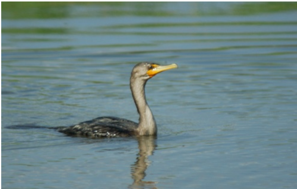
First calendar year Double-crested Cormorant, Edwin B Forsythe Reserve, September 2009

A return to the Edwin B Forsythe Reserve produced much the same as on the last visit with most birds too distant. The Roseate Spoonbill again present but distant and also Black-crowned Night Heron, many egrets and Double-crested Cormorants and 3 Pied-billed Grebes.