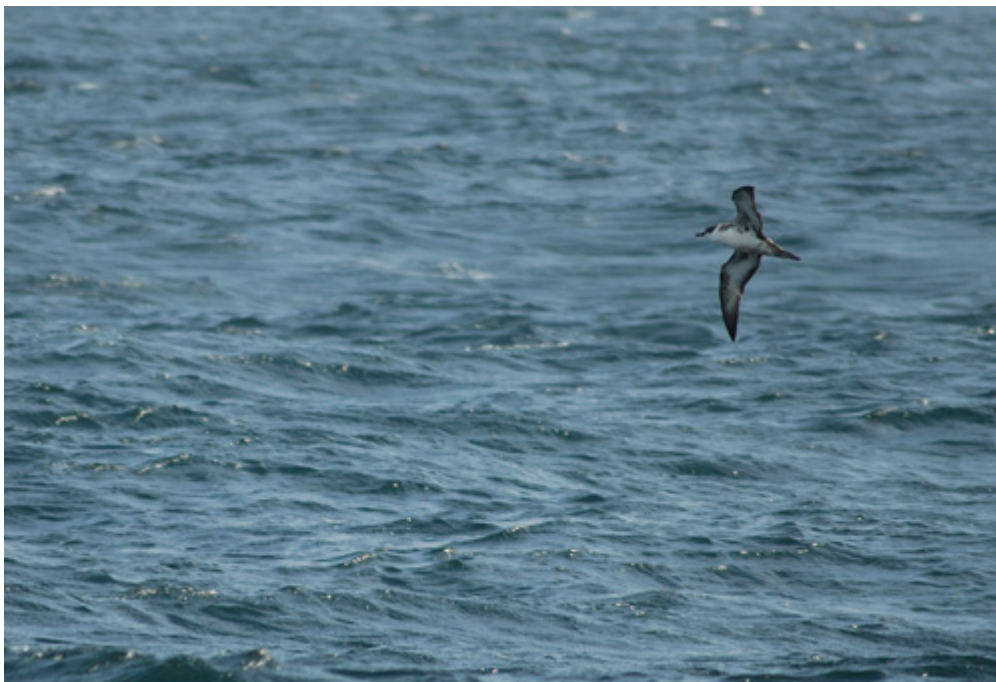
Great Shearwater, Cape Cod, September 2009

Also several Great, 2+ Sooty and 1 Cory's Shearwaters and 2 Wilson's Petrels seen.