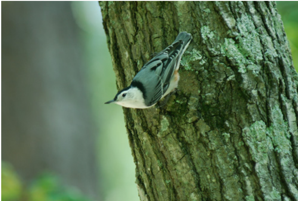
White-breasted Nuthatch, Wharton, September 2009

Many American Robins on the lawn by the nature visitor centre along with 1+ Northern Flicker, Red-bellied Woodpecker in the trees and c.10 Ruby-throated Hummingbirds coming to feeders.