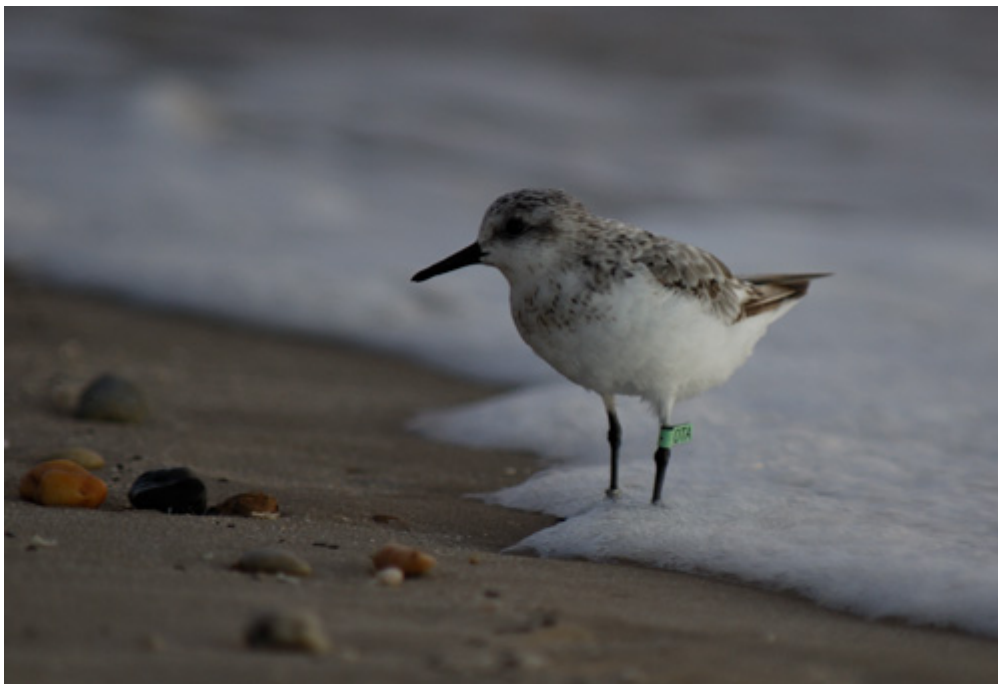
'Leg-flagged' Sanderling, Cape May, September 2009

An evening walk around Higbee Beach was also quiet with a male Prairie Warbler showing well and 3 Sanderling, including one with a leg flag, on the beach and several Bottle-nosed Dolphins present offshore.