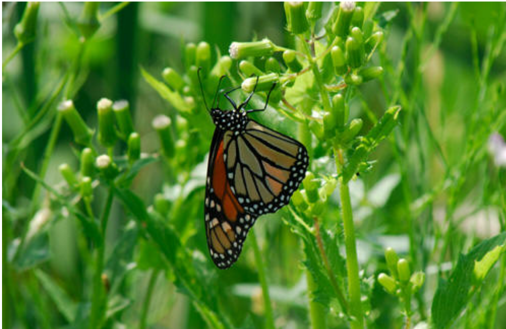
Monarch, Cape May, August 2009

Nearby, several Killdeers around the ferry terminal early evening showed well on the grassy areas.